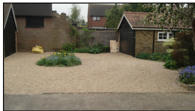
"Good Intent" Intent" Building