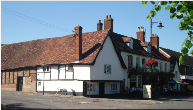
Figure 4. Red Lion Inn

Life for members of the Church in Wooburn Green was not easy. For a while, at least, they had to contend with aggressive anti-