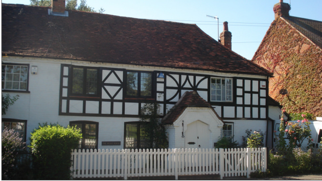
Figure 3. Hancock residence, which doubled as the “Mormon Chapel

in fact exist at the time a “Mormon Chapel” was listed in Mussen and Craven’s Commercial Directory noted above. Pictures of the Hancock residence, which doubled as the “Mormon Chapel” (No. 36 on The Green), as well as the “Red Lion Inn,” are displayed below.