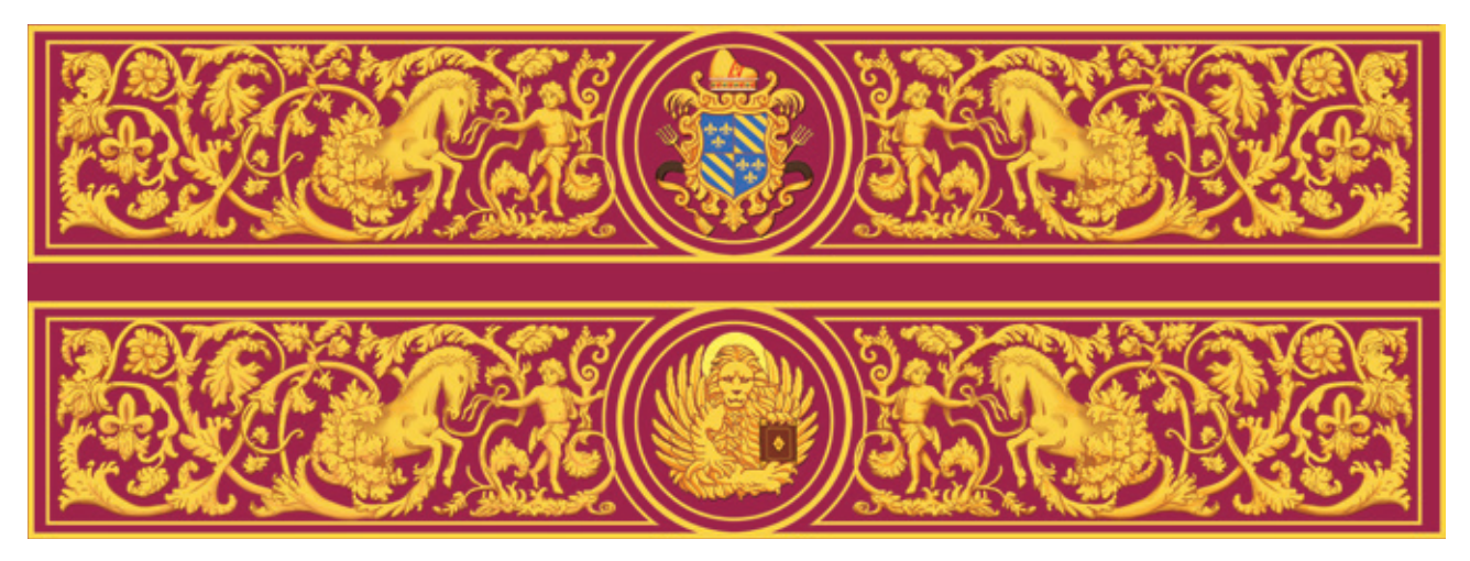
Above: The alternating fringes of the Contarina flag, to the left of the Lion of St Mark.

On the right: The panoplies or military trophies that adorn the vertical borders of the flag, to the left and right of the Lion of St Mark.