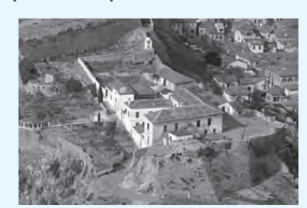
The Kapodistria's hospital area in the early 20th century.

Nafplio becomes the seat of the Turkish governor of Peloponnese. The Ottoman traveler Evliya Çelembi who visited the town in 1668 delivers that within the fortress of Acronauplia existed lots of modest houses and a big mosque, "Fethiye Camii", on the top of the hill, originally a Christian church dedicated to Saint Andreas.