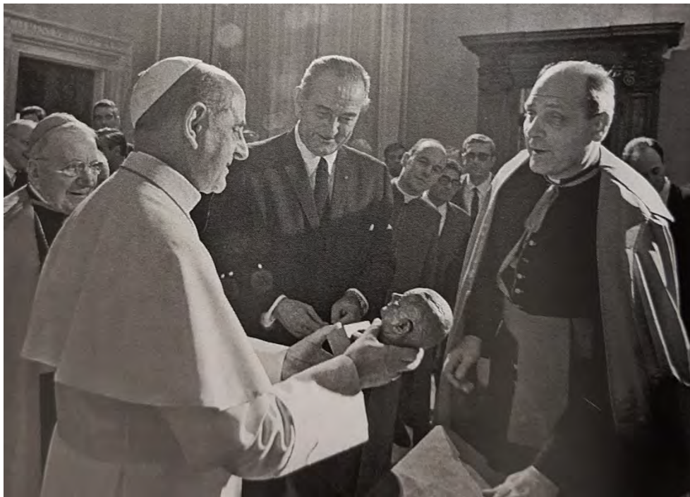
Appendix D: Paul VI and his translator, Fr. Paul Marcinkus (an American), view the bust President Johnson has just presented during his visit to the Vatican, December 23 rd, 1967.