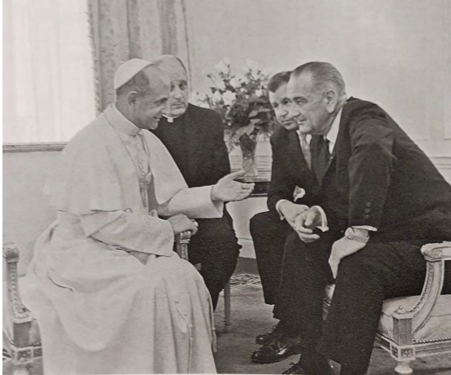
Appendix C: Pope Paul and President Johnson's first meeting at the Waldorf-Astoria in New York City, accompanied by their translators, October 4 th, 1965.