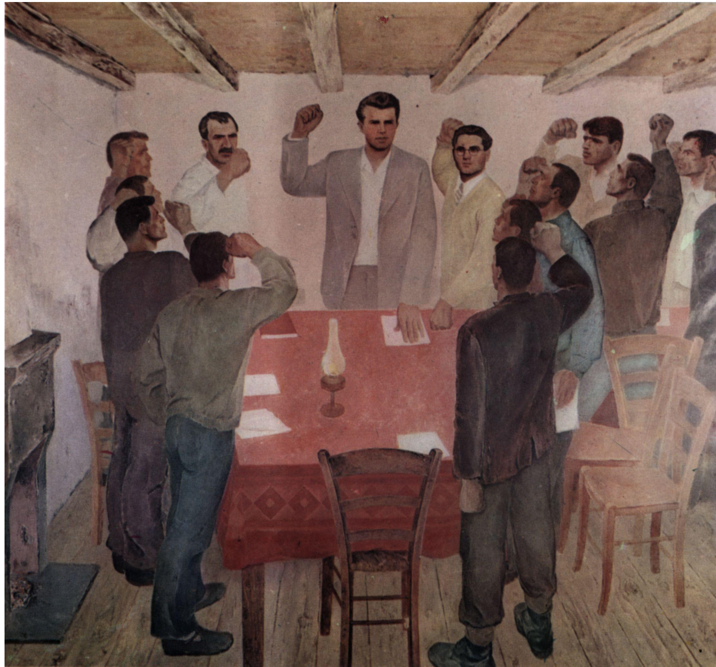
ENVER HOXHA — the founder and leader of the Communist Party of Albania, today the Party of Labour of Albania, (by Sh. Hysa)

GLORY TO THE BRILLIANT AND IMMORTAL WORK OF COMRADE ENVER HOXHA!