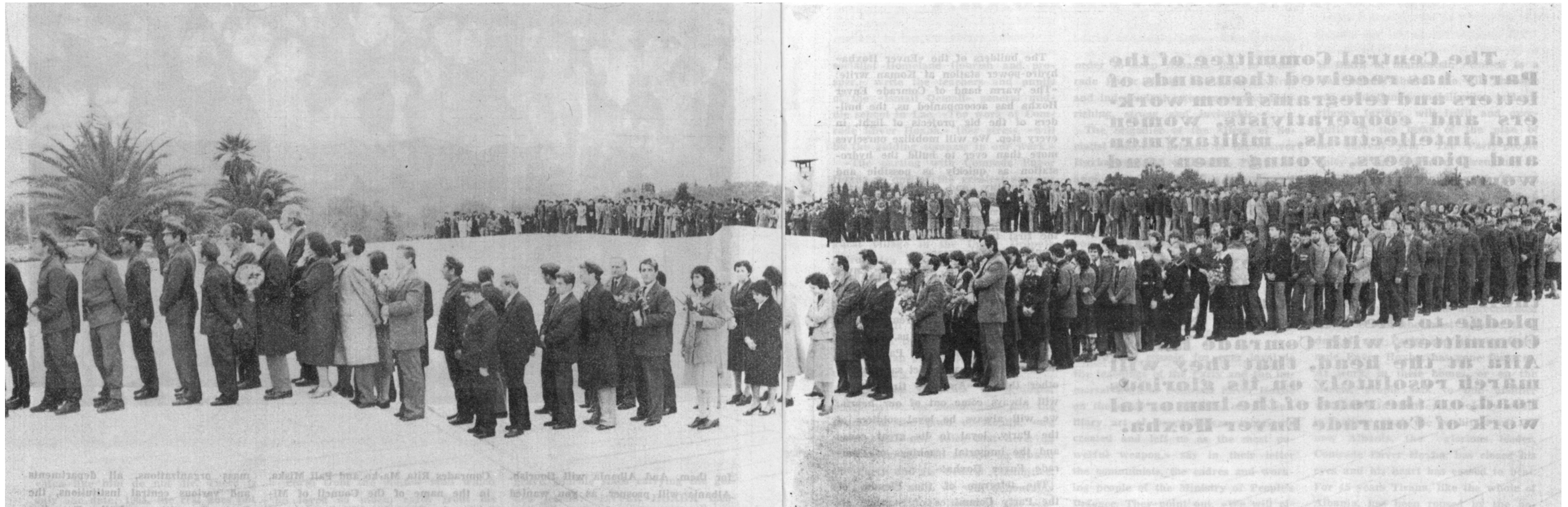
The people pay homage to the grave of Comrade ENVER HOXHA

Thousands and thousands of people from all over the country, veterans of the war and work, workers and cooperativists, intellectuals, militarymen, young men and women, members of «Pioneers of Enver» Organization, go up to the Cemetery of the Martyrs of the Nation. With deep grief and weeping, they honour and respect the memory of the brilliant and immortal work of Comrade Enver Hoxha. They lay bouquets of flowers at the grave of the dear leader of the Party and people. In the book close by the grave they express in writing