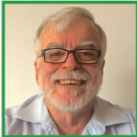
Professor Warwick Middleton

October 30, 2020 | 10:00AM – 5:30PM Eastern Daylight Time