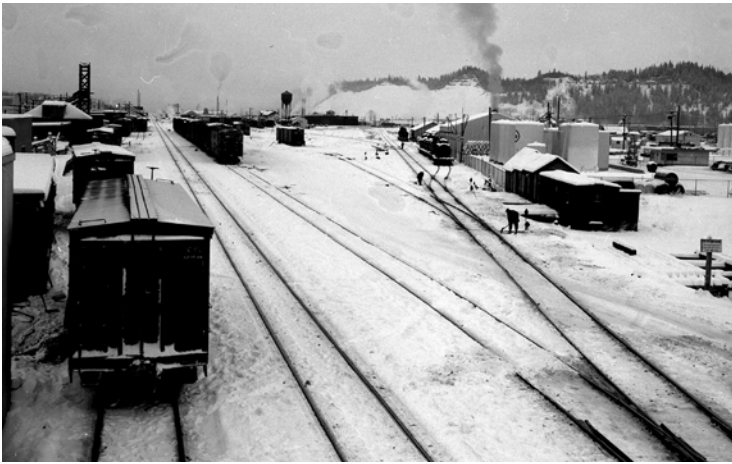
Figure 5: CNR Tracks — 1959.

From the 1910s on, the Island that eventually became the Island Cache was gradually joined to the mainland (through dyking and backfilling), but the area was not part of the City of Prince George until 1970. The area was also cut off from the city by the Grand Trunk Pacific Railway (later Canadian National Railway – CNR) tracks. The CNR land (Foley's Cache) was inside