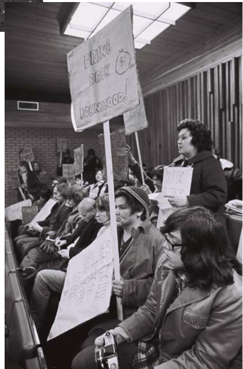
Figure 10: Poor People's Protest in City Council Chambers — 1971.

Life of the Island Cache (Evans et al. under review). A description of one episode will have to serve as an example. After annexation in May of 1970, residents appealed to the city to improve flood protection measures for the community. After a great deal of foot dragging, the city agreed to only half measures, electing to raise the perimeter road (River Road) at a cost of $1500, rather than the dyke itself at $4200. In response residents organized "Operation Sandbag" or "Up the Dyke Day."