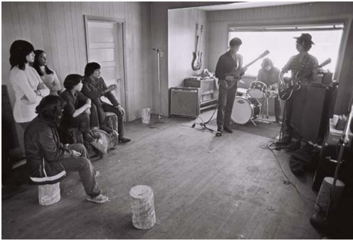
Figure 7: Youth Drop-in Centre — 1972.

of the Island Cache, and hoped to convert the entire area into heavy industry. From 1970 to 1972 there was an increasingly bitter political battle between the city and Island Cache residents, with the city manipulating planning commissions to eventually produce planning documents that flat out said the community should be razed, and the community people building up community infrastructure as best they could. The Island Residents Association