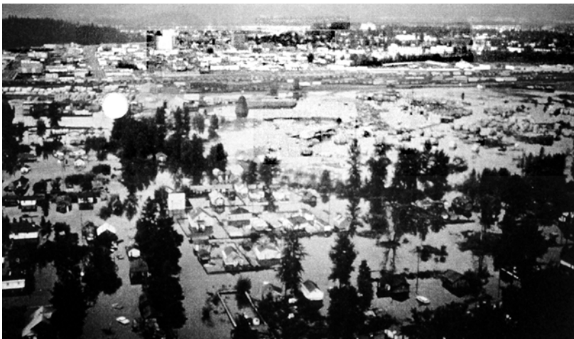
Figure 14: Mid-June Flood — 1972.

. . . before the flood . . . they were dyking. People were just working hard dyking the river. They were . . . sand-bagging and sandbagging . . . ( Int: We found out that the water . . . doesn't just come up over the edge. It comes up underneath the ground . . . it comes up through the bottom ). That's why the sandbag didn't help. Yeah, well, we didn't know that. [laugh] Everybody just worked side by side. (Rose Bortolon née Cunningham, Cache Resident 1969-1972)