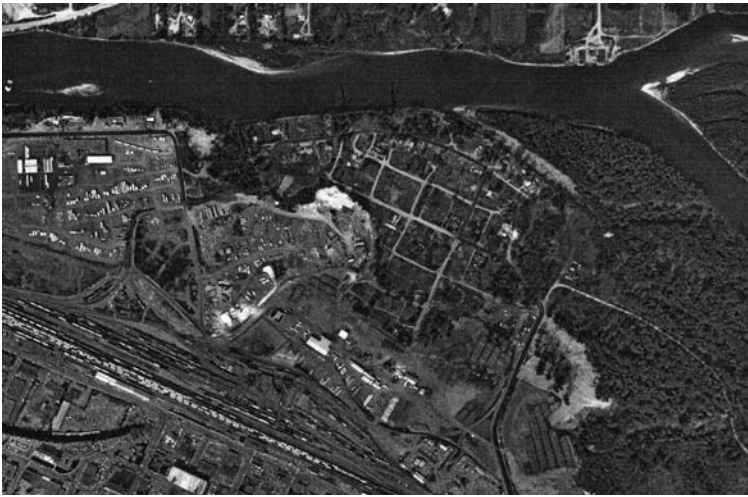
Figure 17: The Nechako Fraser Junction 1978.

Since 1972 the Island Cache has become more and more industrial as low-lying areas have been backfilled and mills have expanded. The eastern part of Cottonwood Island is now a park, and the western part a heavy industrial area (with a very few homes remaining). It is not only difficult to see where the community of the Island Cache once stood — it is a challenge to even see there was once an Island.