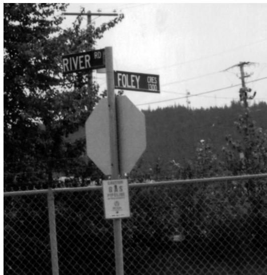
Figure 18: Corner of River Road and Foley's Crescent.

The Island Cache was removed, partly by water, and partly by political power. The memory of the community has been eroded further. It has been erased from the history created by street signs, and substituted with the much earlier, and more westerly, image of Foley and his railway. The Island Cache is not just gone, it has been replaced. There was never a street in the Island Cache called Foley Crescent. Most people