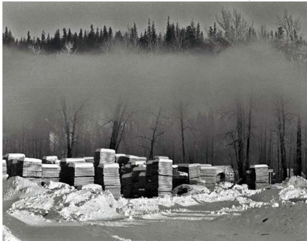
Figure 6: Air Pollution in the Cache — 1972. Photo by Rick Hull courtesy of the Prince George Citizen .

the outskirts of the city at the time (see Parker 1965), the housing stock was varied, and a great deal was sub-standard. The community was a relatively poor place, filled with working class families, families on welfare, and families of the working poor. In the 1960s and 1970s, these people were mostly also either Aboriginal or the most recently arrived immigrants from Europe. Only a small proportion of the community was made up of established European Canadian immigrants — those who were “white” were mostly poor.