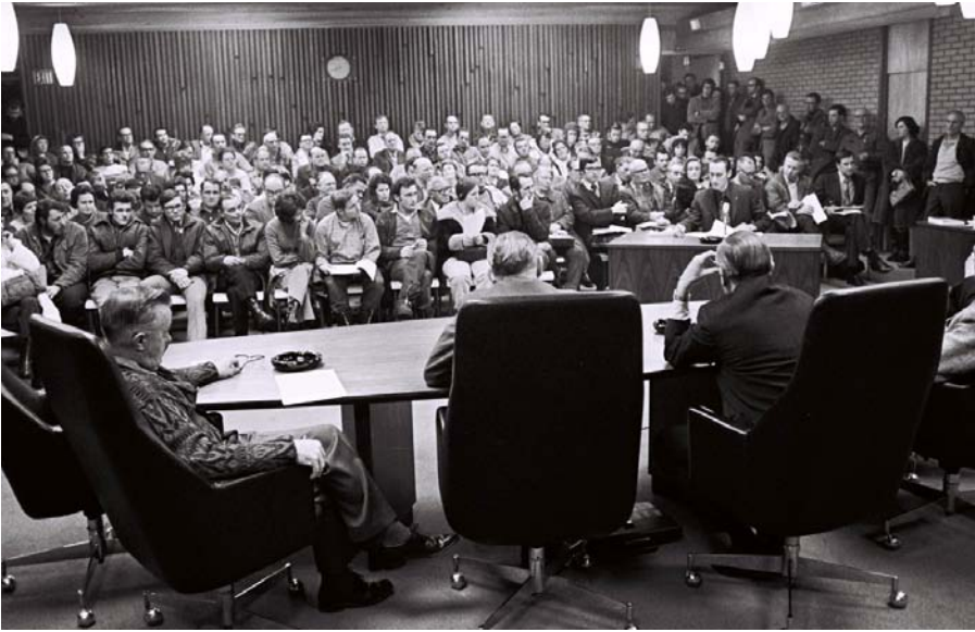
Figure 11: “Crowd In” Protest at City Hall — Winter 1972.