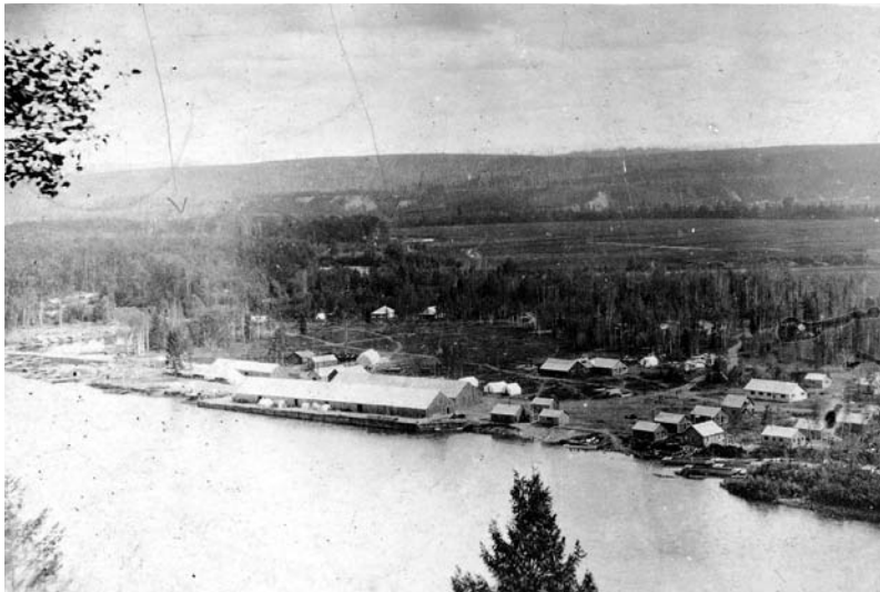
Figure 1: Foley's Cache 1913.

The Island Cache was a small, unincorporated community at the meeting of the Nechako and Fraser Rivers. The place name is actually an amalgam of two previously distinct places. Foley's Cache, an equipment depot associated with the construction of the Grand Trunk Pacific Railway (see Leonard 1996), is the source of the "Cache" part of the name. An island at the mouth of the Nechako, which was later named Cottonwood Island, contributed the 'Island' portion. In 1998, a number of people got together to launch "The Island Cache Recovery Project." The Project was community-centered and participatory. It was guided by an advisory committee consisting of former