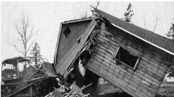
Figure 16: Bulldozer Demolishes Home — 1972.

By mid-June, most of the Island Cache was under water. This was the excuse the city needed. Like the water from the river, the power of the city began to seep under the political dykes the community had built. Using health and building inspectors to condemn buildings, over the next six months the city was able to bulldoze and burn the vast majority of the homes in the community.