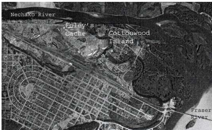
Figure 2: The Nechako Fraser Junction 1955.