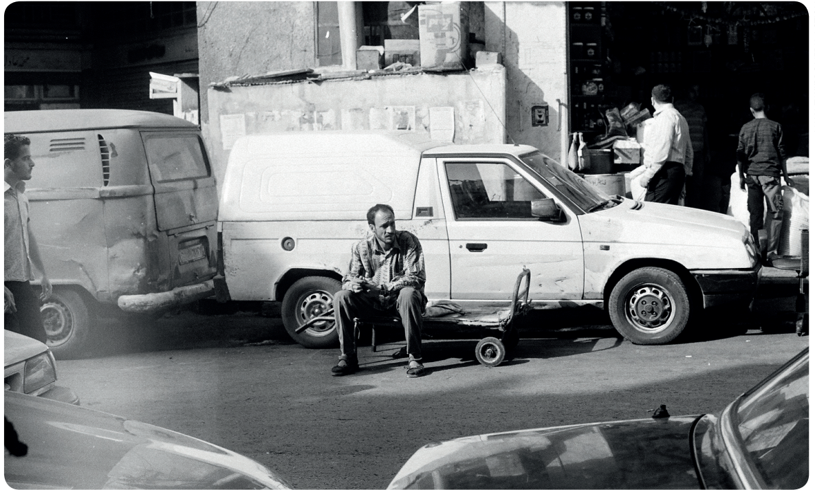
MAHA TAKUBBC MEDIA ACTION