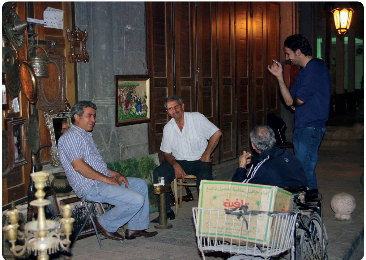
Right Traders and friends outside shops in Bab Sharki, Damascus

During this period the assassination of the former Lebanese Prime Minister Rafiq Hariri and the subsequent withdrawal of Syrian troops from Lebanon put paid to any notion of real reform. Many who once saw Bashar al-Assad as a potential partner, open-minded, and Western-oriented, now see him as just as tied to the regime as his father – a regime far more entrenched and stronger than the President alone. 7