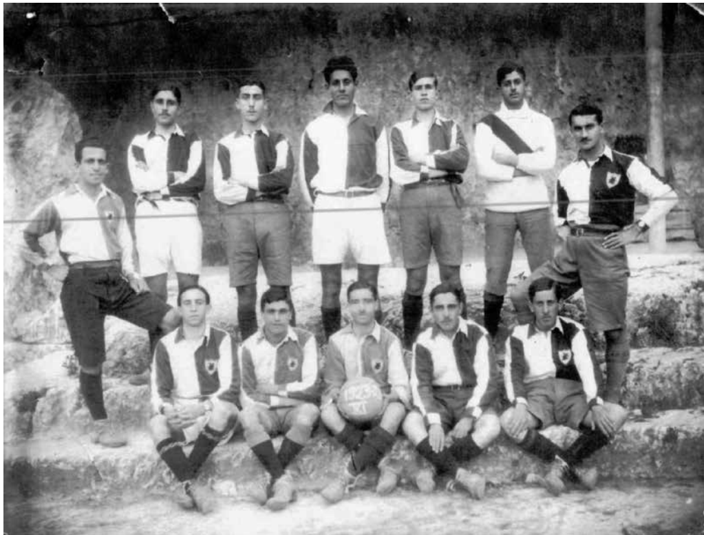
St. George's School football team, Jerusalem, 1923.

of Jerusalem and some of the Orthodox clubs that grew out of church affiliation are prime examples of this. Other teams were established as athletic organizations and later incorporated social and cultural activities. As football took its place among cultural and social activities, city and village football teams transformed into athletic clubs, changing their names accordingly. By the start of the 1930s, Arab athletic clubs in Palestine numbered about twenty.