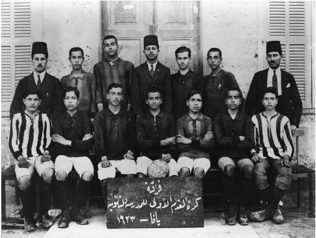
The first-string football team ( firqat kurat al-qadam al-uwla) of the 'Amiriyya secondary school, Jaffa, 1923.

sports (football) among the people. Many of the members who never thought about sports became interested and attended most of the matches, enthusiastically encouraging this activity. 77