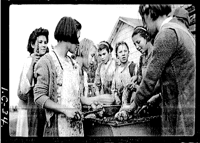
TITLE: Visite Pastorale DESCRIPTION: Île-à-la-Crosse

During the fur trade, pemmican, which was often the only food available to workers and travelers, sustained an industry. Making pemmican was a year-round task, and women were responsible for every step: cutting the fresh meat into long thin strips, drying them, and beating the dried meat into flakes; cutting