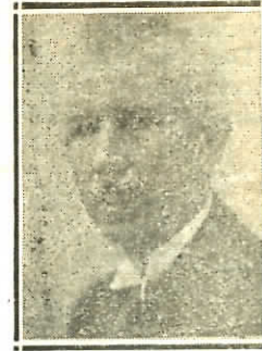
ABDULLAH SAFI AL-YAQUBI , Senator; born, Kirkuk, 1877; educated privately. Appointed Judge, Kirkuk Court of First Instance, 1904; Member, Kirkuk Liwa Administrative Council, 1908; elected Deputy for Kirkuk to the Ottoman Parliament, 1913 to 1918. Returned to Kirkuk after the War; appointed Member of the Senate, 1925.