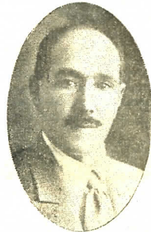
ABDUL LATIF AL-MANDIL , politician and landowner; born, Zubair, 1868. Engaged in trade; awarded the title of "Pasha" by the Turkish Government, 1913; Minister of Commerce, twice; Minister of Waqfs; Member of the Constituent Assembly, 1924; Member of the Chamber of Deputies; Senator; withdrew from politics for health reasons.