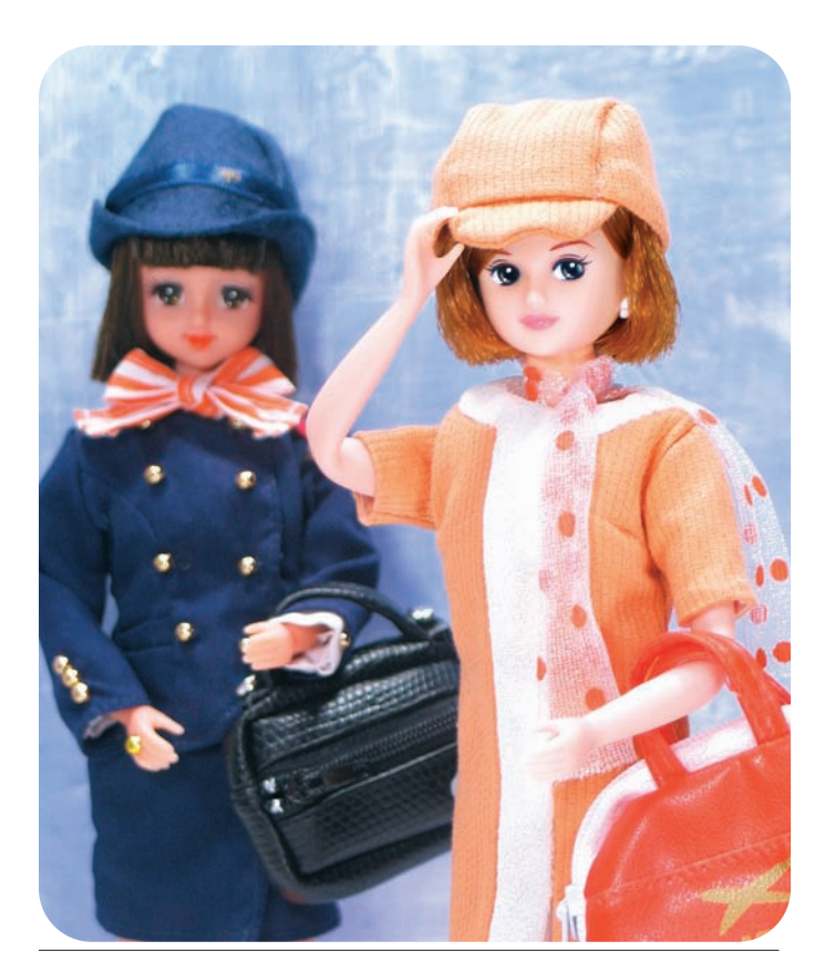
Jenny takes to the sky in these retro flight attendent ensembles. The red bag on the right says, "Air Jenny".

Takara has consistently been on the cutting edge of fashion doll design. Every year they produce a wide selection of Jenny dolls and fashions that are very modern and trendy. Their clothing designs for Jenny are often years ahead of their American counterparts such as Barbie and Bratz . Jenny's fresh and youthful style most often represents what's seen on the streets in Tokyo as well as London and New York. International designers as diverse as Pierre Cardin, Yves St. Laurent, Jill Stuart, Nice Claup and Fiorucci have been inspired to design special dolls and fashions for Takara's Jenny doll line. Many popular designers from Japan including