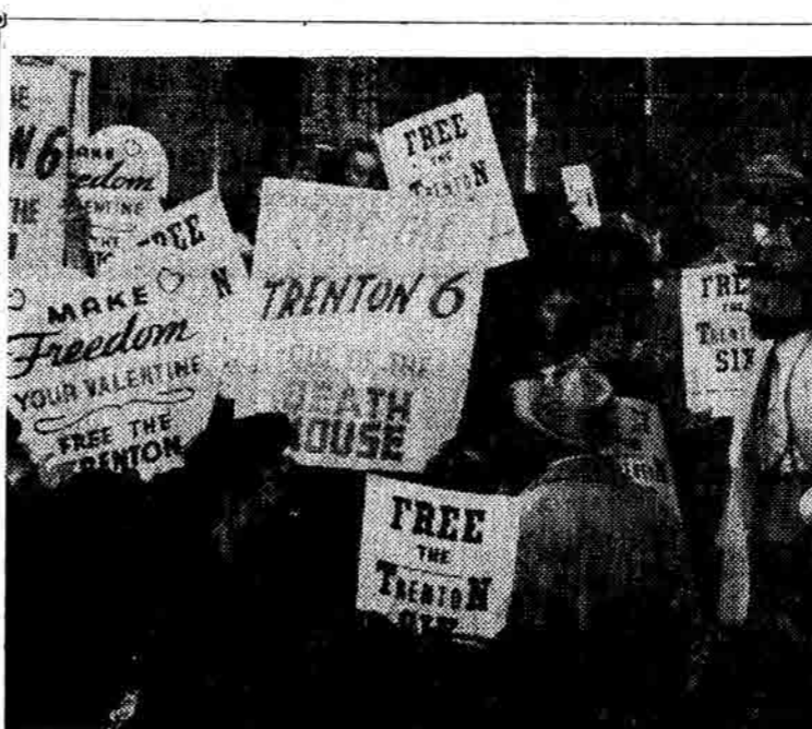
Protesting the death sentence on six Trenton, N. J. Negroes, more than 100 unionists, housewives and Negroes picket the New Jersey State House. Opposition to this Northern Scottsboro frame-up is spreading throughout the nation, but Truman and the other politicians who spoke with such indignation about the Mindszenty case have still to be heard from on this case in their own backyard.