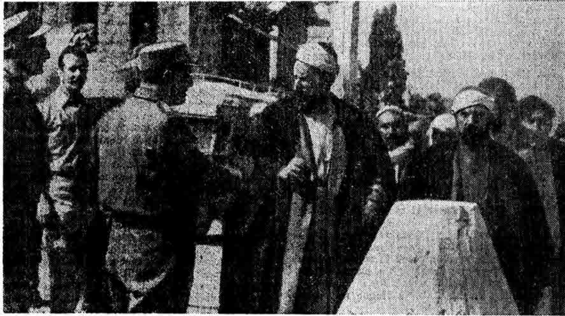
With the termination of hostilities in Palestine and the signing of an armistice between Egypt and Israel, these Transjordan legionnaires bid farewell to their Israeli captors before leaving a prisoner-of-war camp in Jerusalem. While they were being released a like number of Jewish prisoners were freed from Transjordan camps.

What emerges with crystal clarity from the current happenings is that the Stalinists, in a revolutionary situation, are conducting a reformist policy which can — unless a genuine revolutionary party soon grasps the reins of political leadership — lead to a bloody disaster even