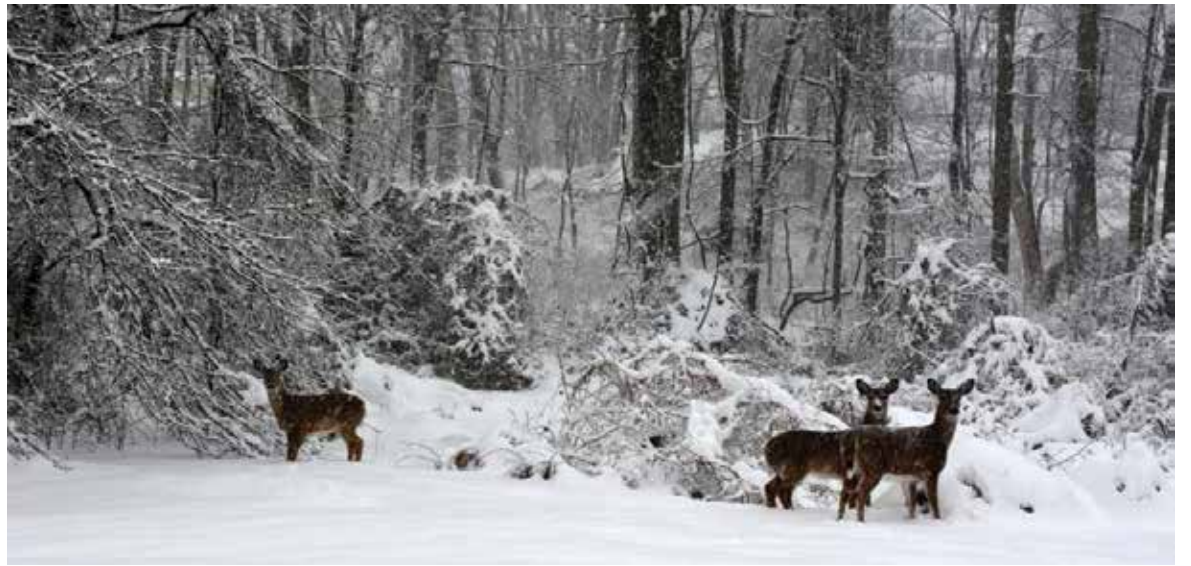
Deer foraging for food in the Reservation