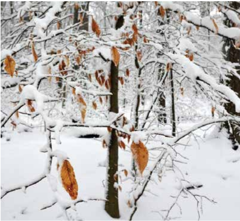
Along the trail near Lake Surprise, a tree refuses to surrender its last leaves