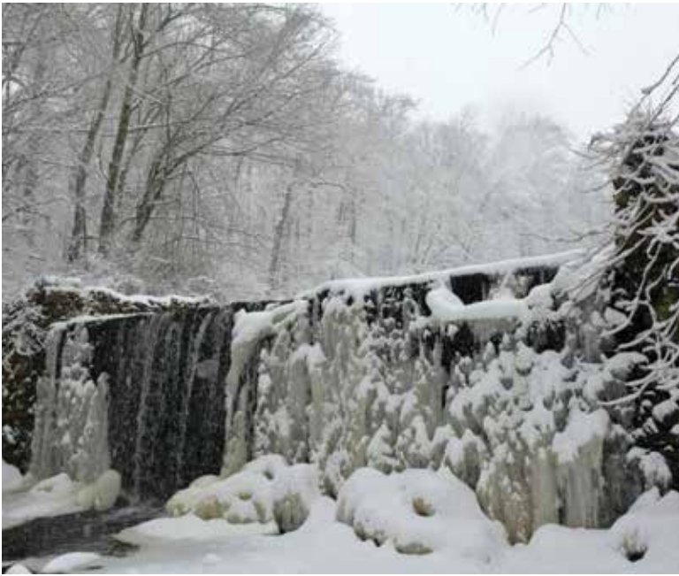
The dam at Lake Surprise in the Watchung Reservation, half frozen, half flowing