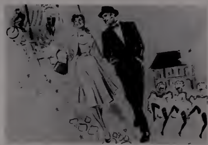
OO LALA — One of four titles to be issued at the middle of each month by VidAmerica and distributed by the new Lightning Video . To Paris With Love features Sir Alec Guinness and Odile Versois, (pictured) coming April 15.

NEW LINE — Moving full force into the area of music video, RCA/Columbia Pictures Home Video has introduced a new line of videocassettes under the title Musicvision . The company kicked off its new line with a party at NYC's Private Eyes video club this past December 20. This is the first assortment of music video programming of its kind ever assembled by a manufacturer, offering everything from Pavarotti In London to A Night With Lou Reed