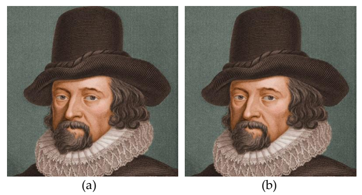
Fig. 3. Mediums before (a) and after (b) the hiding process

Figure 3 depicts the carrier image medium before and after the hiding process.