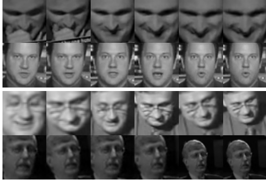
Figure 3. Two false negative pairs on the YouTubeFace dataset. Each two rows are different face videos of the same subject.

(RRNN) [17], Covariate-Relation Graph (CRG) [3] and VGG-Face [23]. It is obvious that Softmax+ASML obtains the best performance compared with other methods. What is more, It improves the accuracy of non CNN-based methods by more than 11% and reduces the error rate of CNN-based methods by about 60%. This significant improvement indicates Softmax+ASML can drive CNNs to generate more robust and discriminative features for VFR.