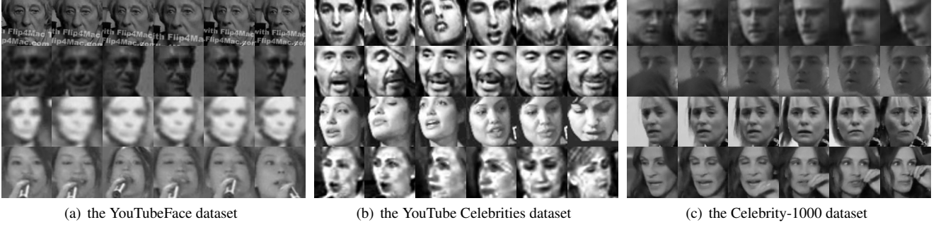
Figure 2. Some face samples in three experimental datasets. Each row in a subgraph represents one person. There are large appearance variations incurred by occlusions, expressions and poses.

Input: Training set: anchor image set X , positive image set Y , negative image set Z , the margin \alpha and the trade-off parameters \lambda_1, \lambda_2 .