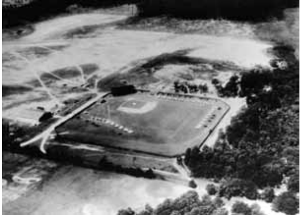
The Biloxi airport, ballpark and golf course as it appeared in 1941.

General Lincoln was sold on the city's proposal, and he recommended Biloxi as one of two locations most suitable for a new technical training base. But events had already moved well beyond the projections of 1941, and when the War Department anticipated the schools' student capacity would increase from 5,200 to 12,000 and then to 24,000 troops, Army engineers had to revise building plans. More land had to be acquired and additional