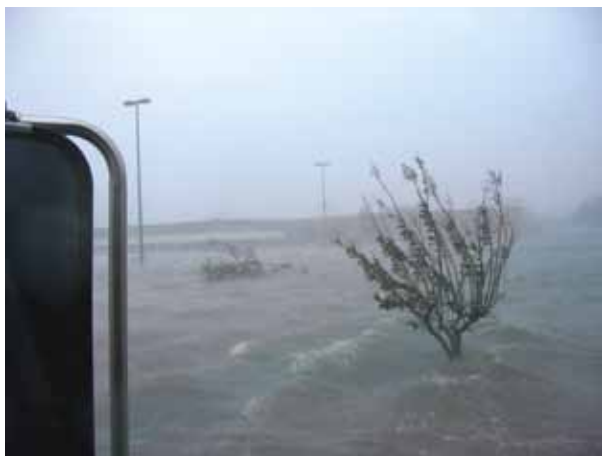
The BX and Commissary under five feet of water.

The water from Biloxi’s Back Bay swamped Keesler’s northernmost thoroughfare, Ploesti Drive. The main road running north and south, L a r c h e r Boulevard—along with 50 percent of the base—became submerged. The BX and Commissary were inundated under more than five feet of water;