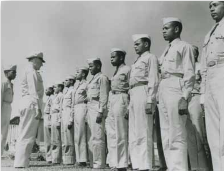
Keesler's first graduating class of African-American airplane mechanics, 1944.

Generally unbeknownst to many was the role that black troops played at Keesler. Despite the fact that Mississippi, and indeed, the military, was still segregated, more than 7,000 African-Americans were stationed at Keesler Field by the Autumn of 1943. These soldiers included pre-aviation cadets, radio operators, aviation technicians, bombardiers, and aviation mechanics. Many others, like First Sergeant Lucius Theus, a future major general, also served with distinction in Keesler's permanently assigned black units. Keesler also trained a small number of black aircraft mechanics from the Tuskegee Institute. These African-American service members took a giant step forward in their goal of winning wars on two fronts—the struggle against racism at home and the fight against foreign enemies abroad.