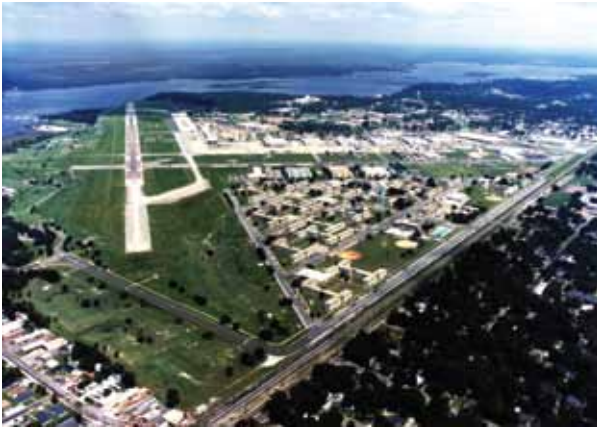
Keesler AFB’s premier "Triangle Vision."

On 4 October 1996, Keesler officially implemented “Triangle Vision,” an ambitious five-year, $23-million building project designed to modernize the base’s 1950s era technical training dormitories and dining facilities. The first phase of the project called for the selective short-term