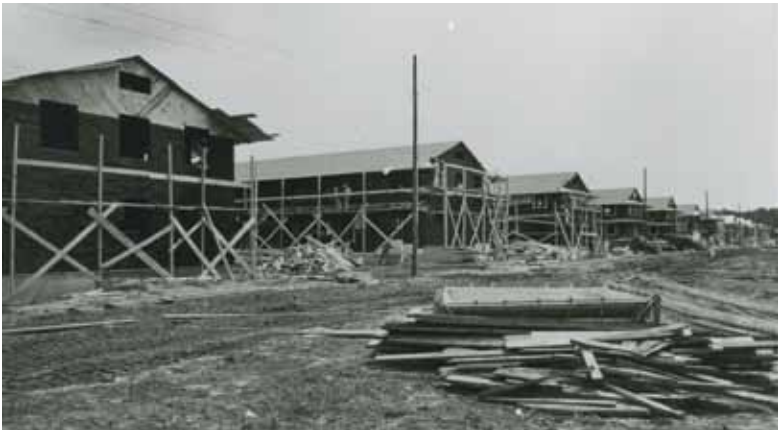
Row of barracks in various stages of completion, Fall 1941.

The first shipment of recruits arrived at Keesler Field on 21 August 1941. During World War II, the Army's basic training program was little more than a reception process. It accessioned and outfitted new recruits, gave them a brief introduction to military life, and then shipped them to a technical school. At Keesler, basic training lasted four weeks, during which time classifiers determined the type of follow-on schooling each recruit would receive. Many stayed at Keesler to become airplane and engine mechanics, while others transferred to aerial gunnery or aviation cadet schools. Trains passed through Keesler daily, dropping off new trainees while picking up recent graduates.