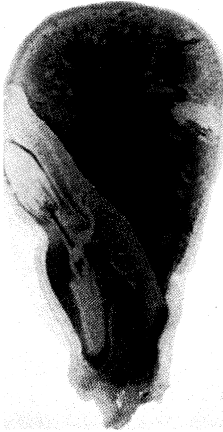
Figure 3. Longitudinal section through a mature maize kernel to show its parts. The cut surface was treated with an iodine-potassium iodide solution to stain amylose in the starch granules of individual cells. The narrow outer layer of the kernel is the pericarp, a maternal tissue. The embryo and endosperm are side-by-side but clearly delimited from each other. The endosperm is above and to the right of the embryo. In this photograph, four parts of the embryo may be noted. To the left and adjacent to the endosperm is the scutellum with its canals. The shoot, to the upper left, and the primary root below it, are connected to each other by the scutellar node. The different staining intensities in the endosperm cells reflect different amounts of amylose in them. These differences relate to the presence and action of a transposable A element at the Wx locus (23). The Wx gene is responsible for conversion of amylopectin to amylose, but only in the endosperm, not in the embryo.