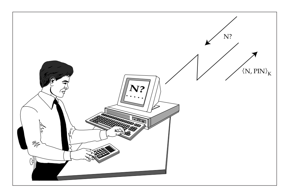
Figure 4.1: – password generator use

calculator in which I can insert my bank card to do the crypto.