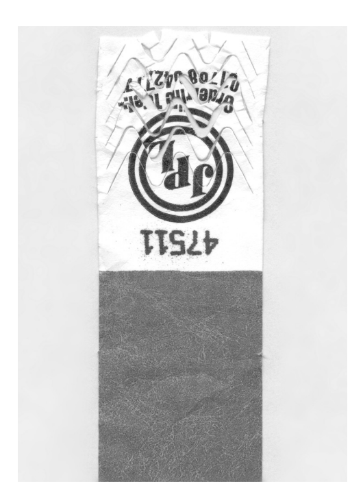
Figure 16.2: – a wristband seal from our local swimming pool

once, then ease it off gently by pulling it alternately from different directions, giving the result shown in the photo. The printing is crumpled, though intact; the damage isn't such as to be visible by a poolside attendant, and could in fact have been caused by careless application. The point is that the damage done to the seal by fixing it twice, carefully, is not easily distinguishable from the effects of a naive user fixing it once. An even more powerful attack is to not remove the backing tape from the seal at all, but use a safety pin, or your own glue, to fix it.