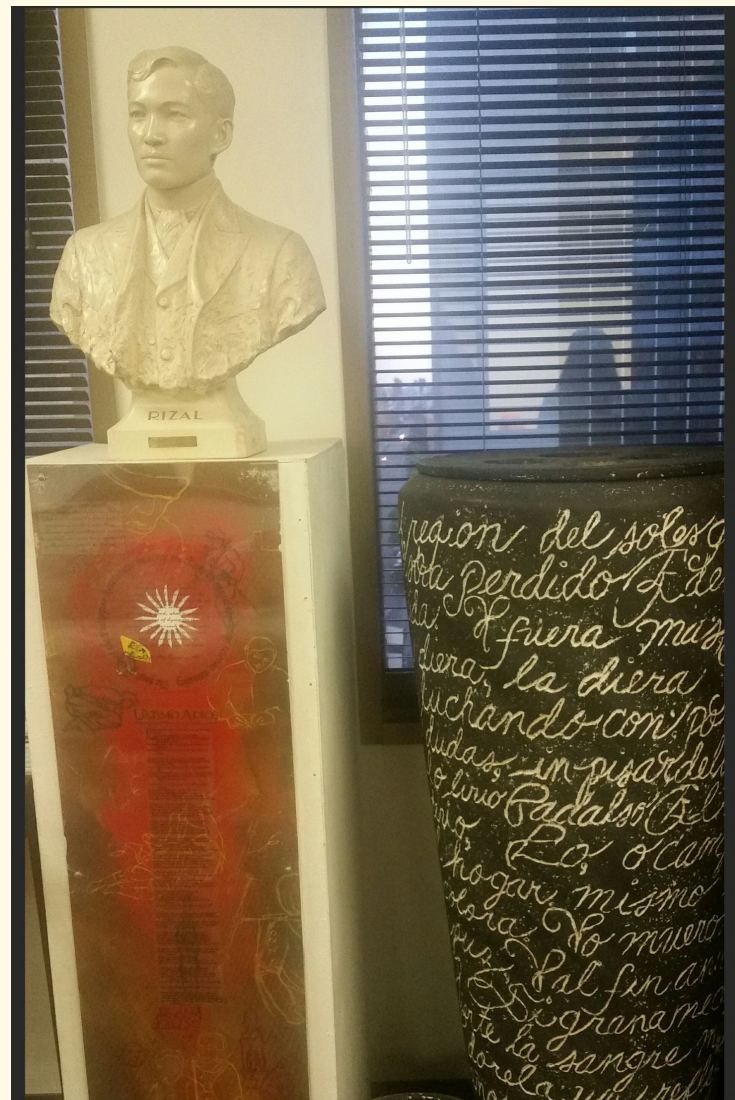
The Sentro Rizal at the Philippine Consulate General in Los Angeles

Sentro Rizal is mandated to promote Philippine arts, culture, literature, history and languages around the world through the Philippine embassies/consulates and/or institutions of countries where there are large concentration of Filipinos; to enhance the knowledge of Filipino overseas about their cultural heritage by conducting language courses/ lessons and cultural programs/ events; and to provide interested local and foreign individual or groups with relevant resources on Philippine culture and arts and on other related topics through networking, resource sharing or personal assistance.