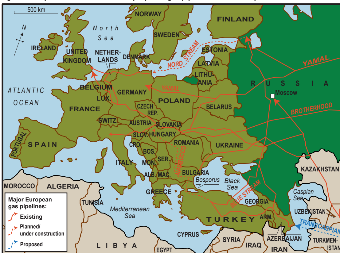
Figure 3: Map of selected current and proposed gas pipelines across Europe

Source: Produced by TSO based on an image in the Economist, 8 January 2009