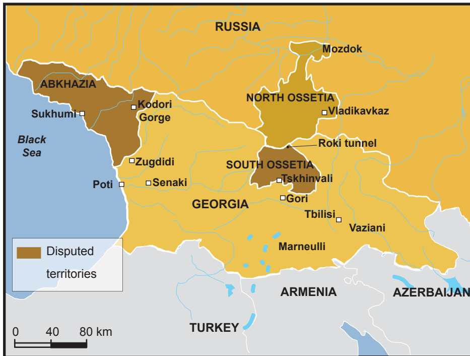
Figure 1: Map of Georgia including the disputed territories