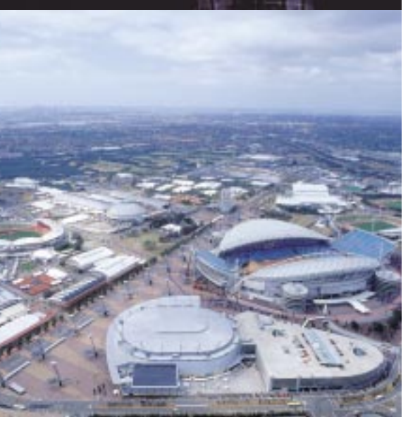
Energy Australia provided the Olympic Cauldron, as well as all of Stadium Australia and other venues, with 100% renewable energy. Olex Cables, a Sydney 2000 Supporter, worked with Energy Australia to place all power underground.