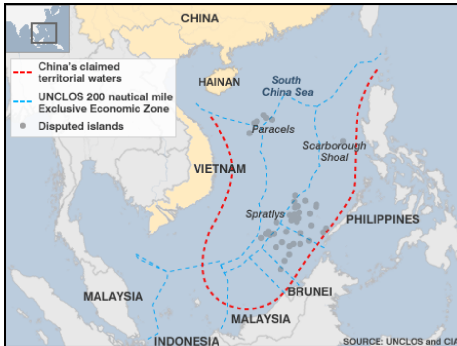
Figure 2. Contested Boundaries in the South China Sea

Sino-Philippine maritime tensions have continued since that incident. Since February 2013, China reportedly has sent naval vessels to the Second Thomas Shoal ( Ayungin ), in the Spratly Islands group, in an apparent attempt to isolate and bring about an end to the Philippines presence there. Since 1999, the AFP has stationed several troops on the BRP Sierra Madre, a U.S. World War II-era naval vessel which the Philippines acquired in 1976 and intentionally ran aground in the shoal in order to maintain its claim to the area. In March 2014, two Chinese coastguard ships reportedly blocked two Philippine supply ships from reaching the Sierra Madre, claiming that they were carrying construction materials.