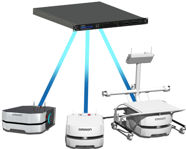
OMRON fleet simulator optimizes traffic and workflows for fleets of autonomous mobile robots.