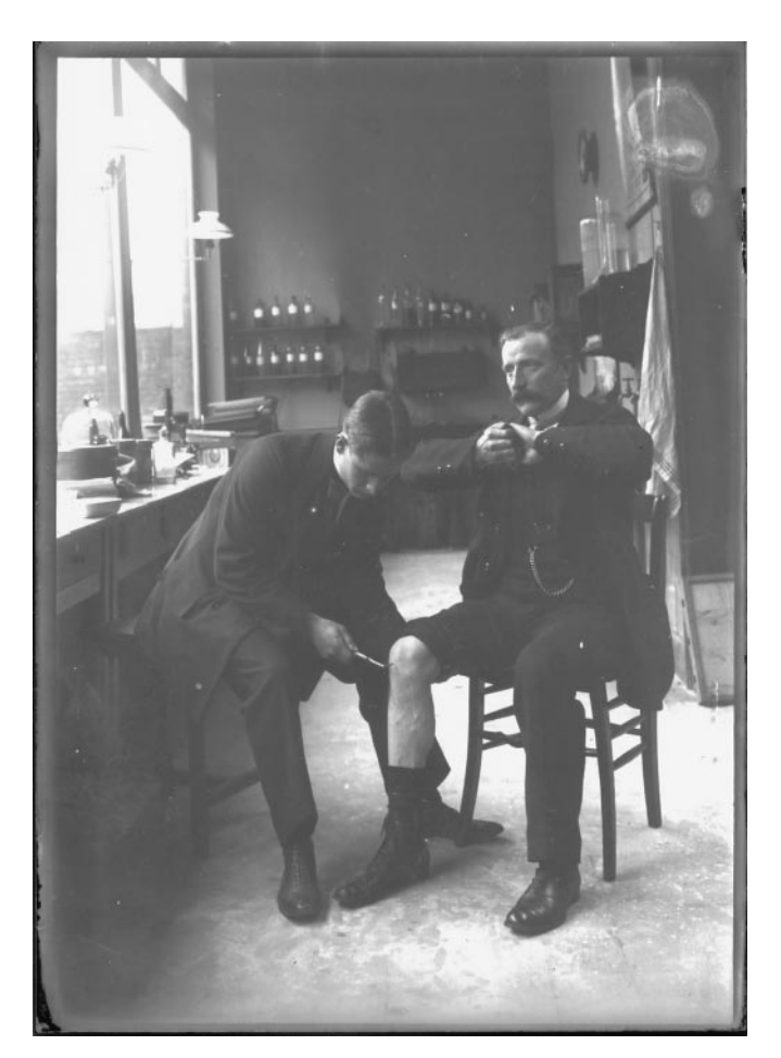
Figure 2. Van Gehuchten's photograph, showing the Jendrassik maneuver to reinforce knee jerk (figure 186 of Les Maladies nerveuses<sup>17</sup>).

Paris had been the hub of the rich interactions