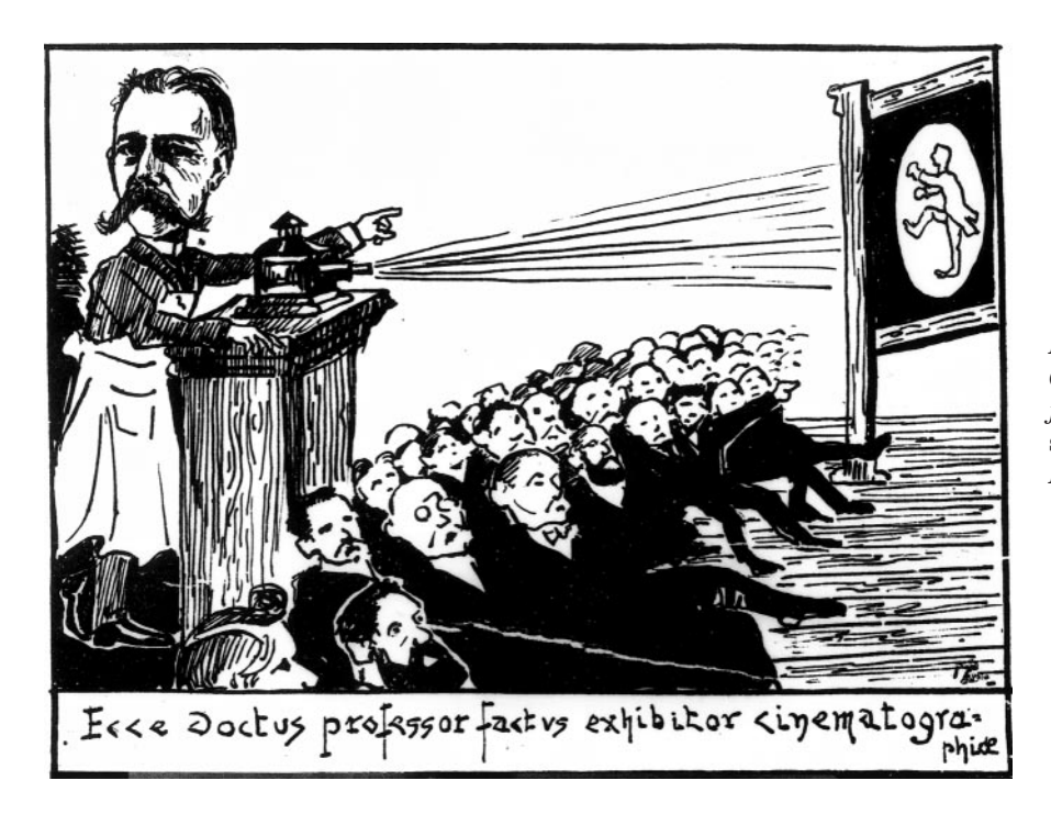
Figure 4. Caricature of Arthur Van Gehuchten. From Ons Leven, a student journal of Louvain.

preservation by one of the best film archives in the world is also notable.