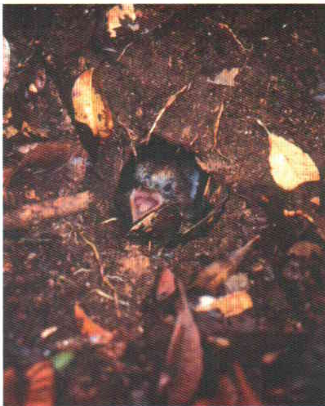
Figure 3: Photo of a nestling at 21 days old (three days before fledgling). The nestling travelled up to the nest entrance gapping for food after we imitated the female's call

ing brooding and nestling periods probably relates to the provisioning of the female during the brooding period.