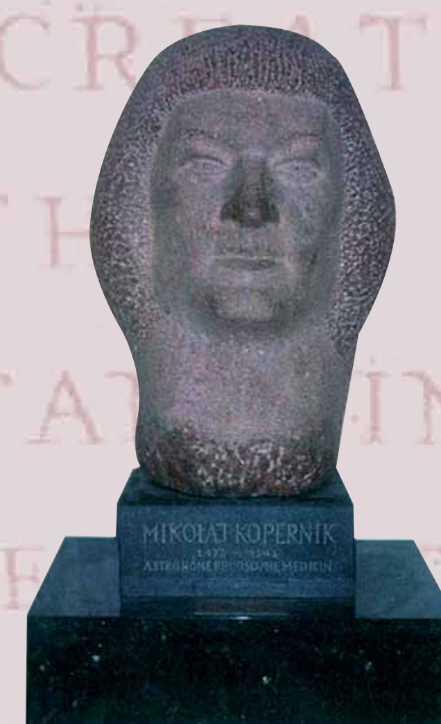
Bust of Nicolaus Copernicus by Alfons Karny in the seat of the United Nations in New York, 1970