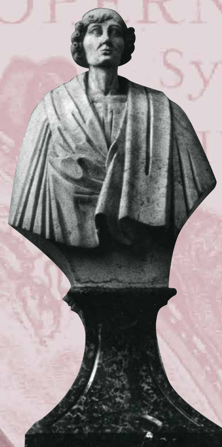
Bust of Nicolaus Copernicus by Wojciech Rojowski, sculptor from Kraków, located in Toruń and funded by prince Józef Aleksander Jabłonowski, voivode of the Nowogródek Voivodeship, 1766; it is the oldest monument of Nicolaus Copernicus in the world; kept for several decades in the city hall, in 1809 it was moved – following an intervention of Stanisław Staszic – to Basilica of St John the Baptist and St John the Evangelist, 1967