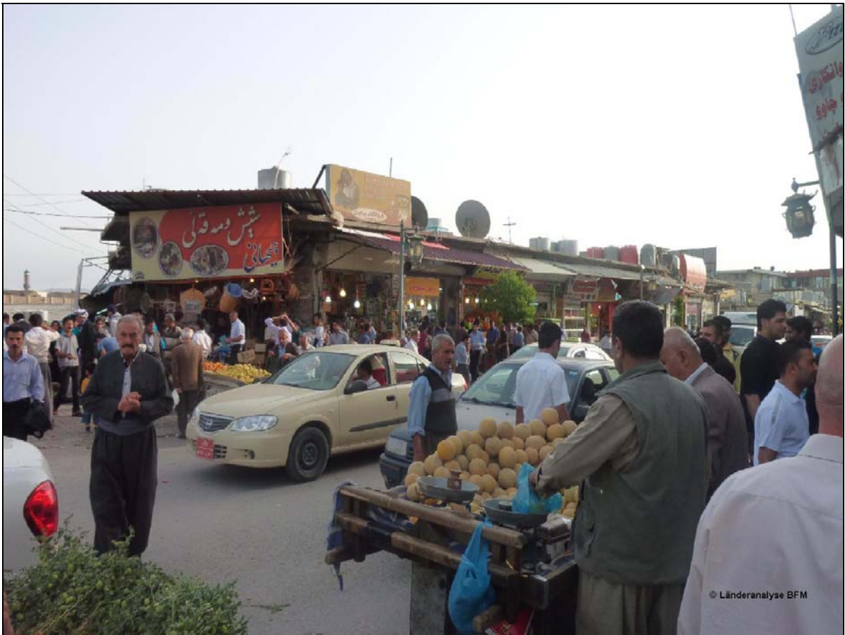
Market in Sulaymaniya, May 2011.