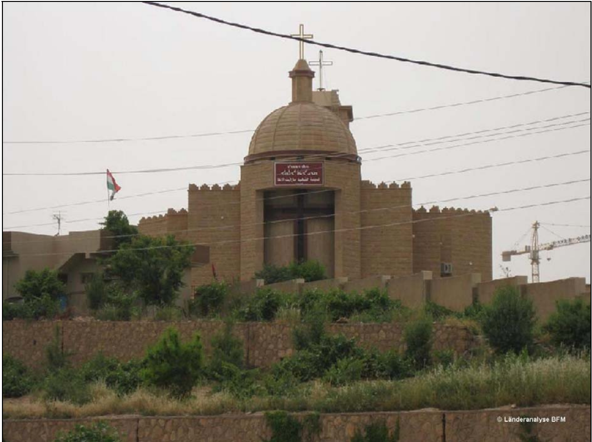
An Assyrian Church in Dohuk.

Church 197 ; the Assyrian Church of the East, or Nestorian Church; and the Assyrian Evangelical Church), the West Syrian churches (including the Syrian Orthodox and Syrian Catholic churches), the Melkite Church (Greek Orthodox and Greek Catholics), the Armenian Church (Armenian Apostolic and Armenian Orthodox), and the Occidental Christians (Roman Catholics, Anglicans, Presbyterians, Pentecostals, Adventists, and Evangelicals). 198 According to a Danish report, there are about 50 Christian churches of various denominations throughout the KRG region. 199