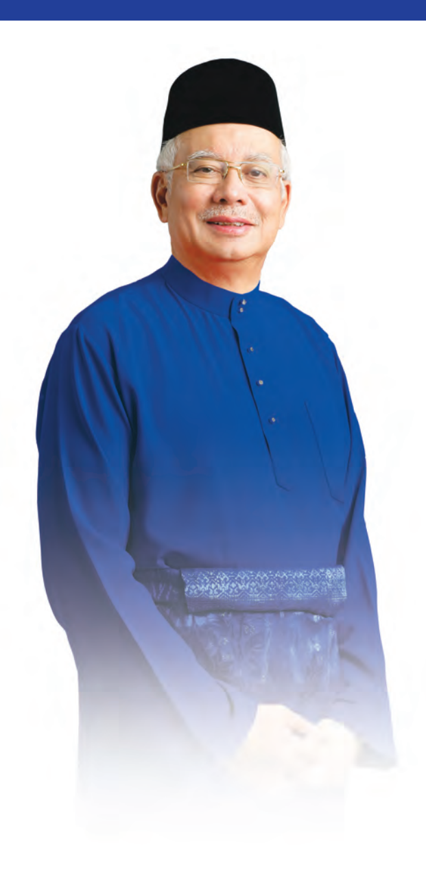
YAB Dato' Sri Mohd Najib Tun Haji Abdul Razak Prime Minister and Minister of Finance Malaysia