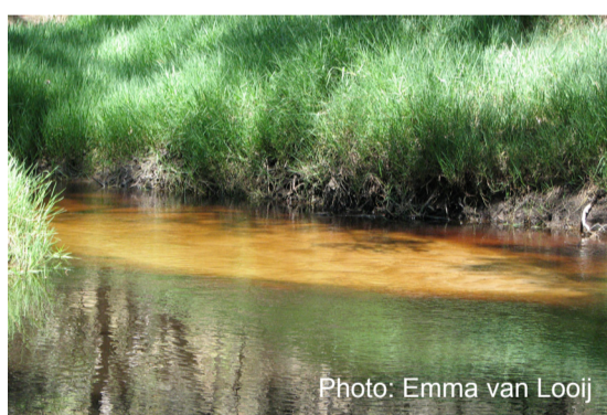
A sand slug near the bottom of Ellen Brook.