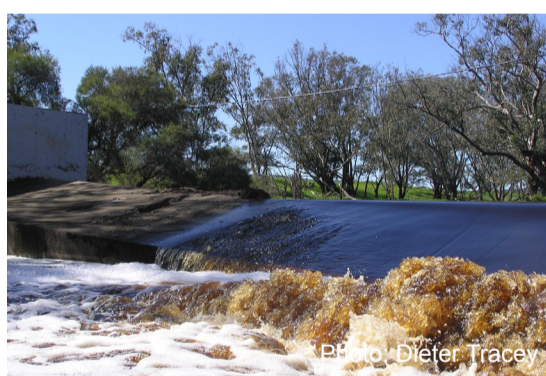
The dark, tannin-stained water of Ellen Brook as it flows over the gauging station weir.