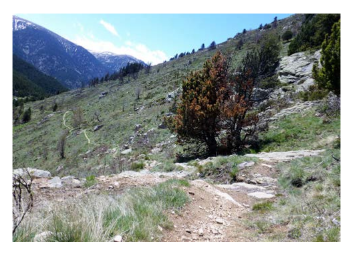
A portion of the trail under gentler conditions in May.

Two days later and after negotiating mountain passes over 7,500 feet in altitude, Virginia arrived exhausted in Spain. But there she made a mistake, unusual for a