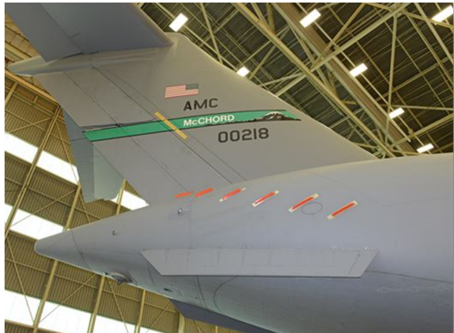
Six aft body drag reduction devices, or microvanes, are bonded to each side of the C-17 Globemaster III fuselage.

By collaborating with organizations like the Air Force Research Laboratory, industry partners, and academia, we are able to identify which emerging technologies are best aligned to help optimize our fuel use. For example, we are working with Air Mobility Command to add aft body drag reduction devices at a very low cost to our large mobility aircraft, which will reduce fuel consumption by 1-3 percent and extend range.