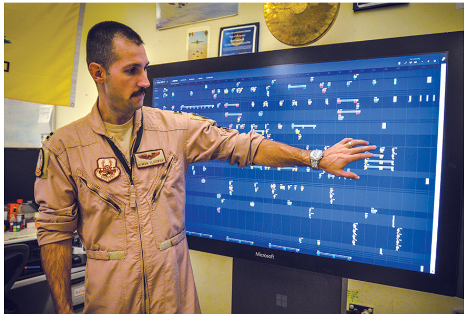
Air Force Operational Energy partnered with Defense Innovation Unit (DIU) to help develop Jigsaw, which was deployed in April 2017.

For instance, we are providing funding to add an auto-plan feature to a deployed tanker scheduling tool called Jigsaw. Used at Al Udeid Airbase Qatar, Jigsaw has already increased efficiency by 3.6 percent, saving two tanker missions per day. This upgrade will further improve scheduling efficiency, allowing for more fight with less fuel.