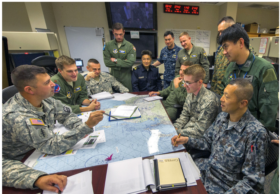
Air Force Operational Energy participates in wargaming to inject a more realistic view of the risks and challenges related to fuel logistics.

Our office participates in Air Force and Joint wargames, such as Global Engagement 2018 and the Long Duration Logistics Wargame. We provide energy and fuel logistics expertise to ensure accurate execution and accounting of operational energy. Doing so allows us to identify fuel logistics challenges and propose potential solutions.