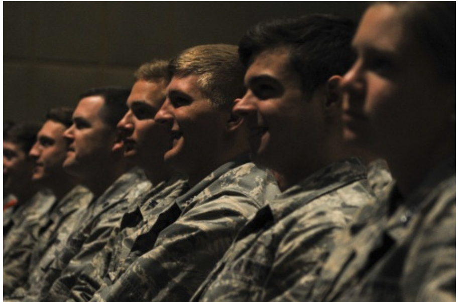
Commander's calls, Energy Action Month events, and public speaking engagements all help to build support for an energy aware culture.

Strategic communications plays an important role in educating Airmen and stakeholders on the criticality of operational energy to the Air Force mission. We continue to develop and expand our communications strategy and messaging through awareness campaigns, content development, digital media, and leadership speaking events.