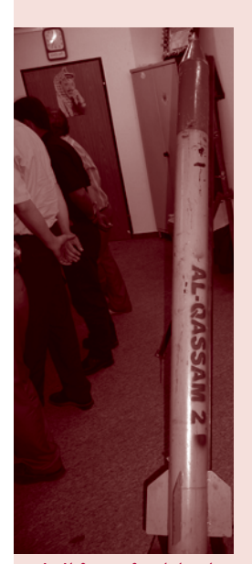
An Al-Oassam 2 rocket rests on a tripod in Gaza, 2002.

Various Palestinian armed groups produce light weapons. The Ezzedine Al-Qassam Brigade of Hamas, for example, manufactures the Al-Qassam rocket.<sup>10</sup> The Al-Qassam, first introduced in 2001, has subsequently seen improvements in its payload