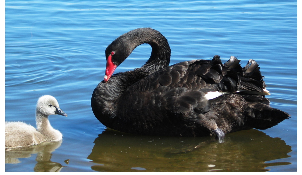
The famous swans of Perth.