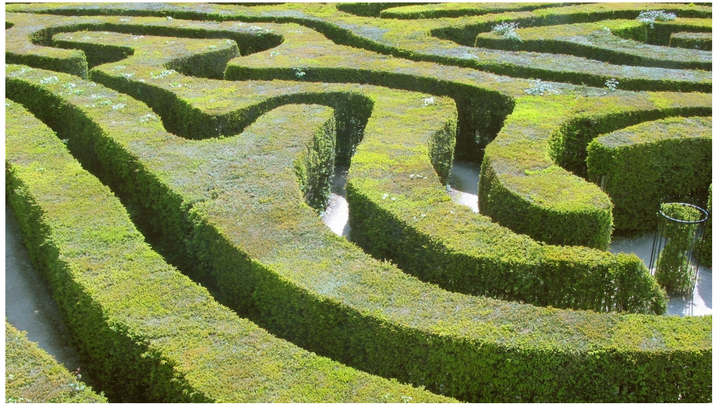
A hedge maze.