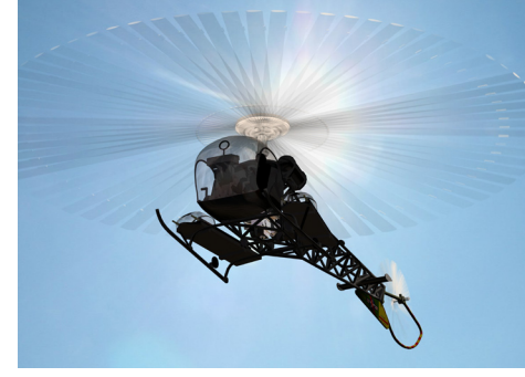
Helicopter tours.

SOURCES www.experienceperth.com www.australiatourism.com http://wikitravel.org