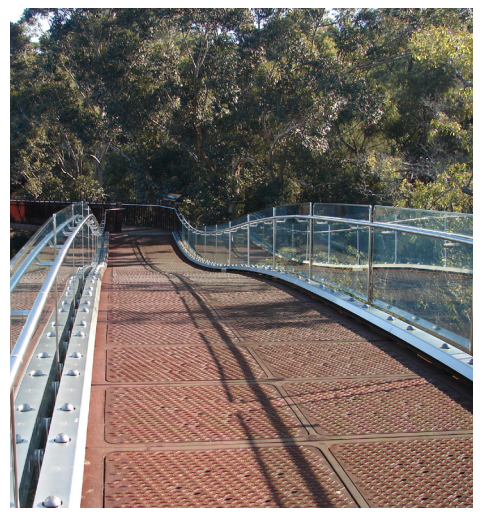
Famous Tree-Top walk-trail, 40m height from forest ground.