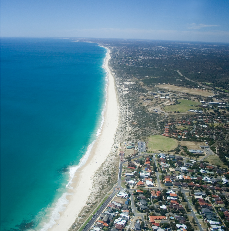
Perth has many wonderful beaches.

Explore Western Australia's oceans and rivers via displays and interactive exhibitions. See some of the local marine species up close. The center has all facilities including a gift shop, cafe, handicap friendly facilities and parking.