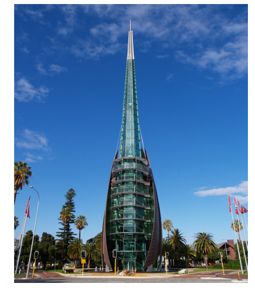
The Bell Tower.

Eurotourism Media Group AB: Box 55172 504 04 Borås Sweden Tel +46 33-233220 Fax +46 33-233222 info@australiatourism.com Copyright © 2009 Eurotourism. Protected by international law; any violation will be prosecuted. An Independent Tourist Information Company