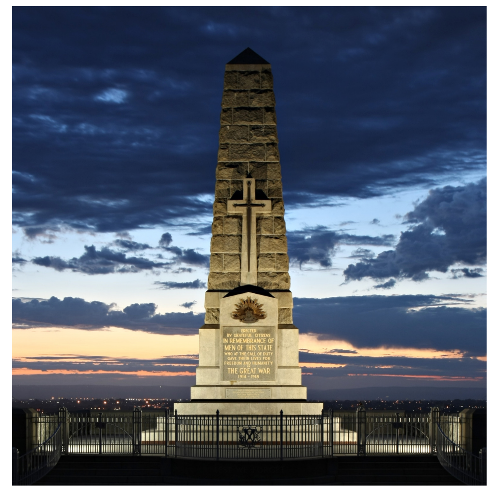
War Memorial at Kings Park, Perth.