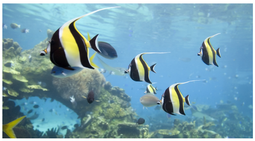
Learn about all sorts of marine life, like the Moorish Idols.

Eurotourism Media Group AB: Box 55172 504 04 Borås Sweden Tel +46 33-233220 Fax +46 33-233222 info@australiatourism.com Copyright © 2009 Eurotourism. Protected by international law; any violation will be prosecuted. An Independent Tourist Information Company