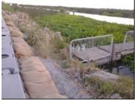
Muscle Wall placement on North levee

The Muscle Wall was placed just in time for a 4.43' high tide (NOAA estimated for False River) on July 2<sup>nd</sup> (see photo right)