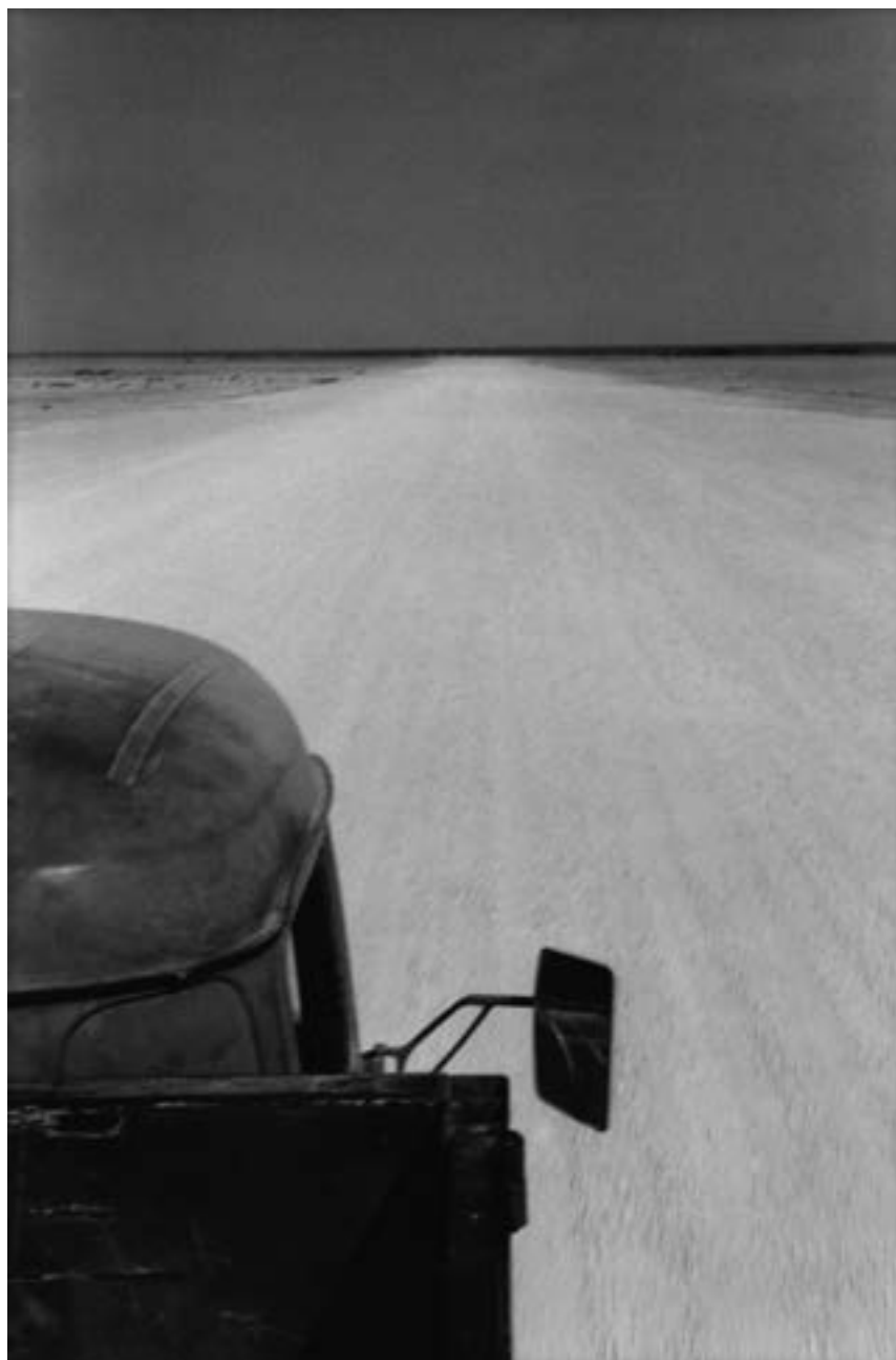
Dahlak Islands, Eritrea, 1995

Press opening: Tuesday September 12, 9 a.m. - 12 p.m.