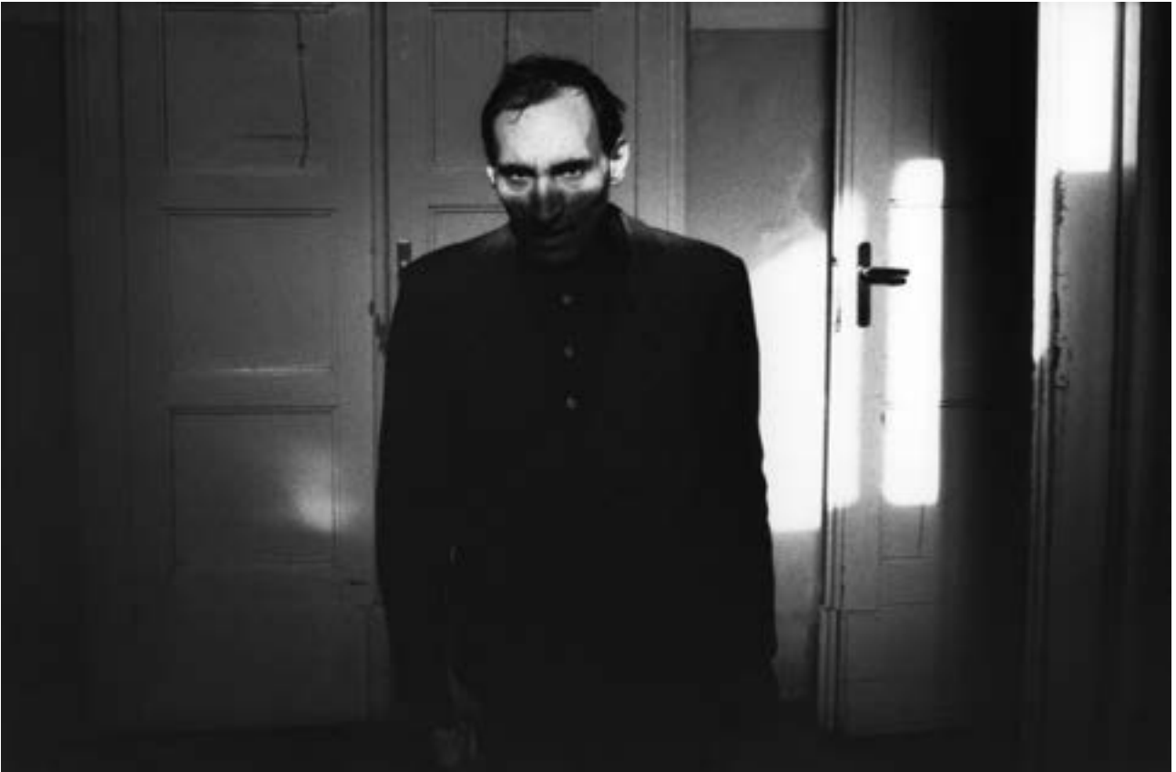
Collegno psychiatric hospital, Turin, Italy, 1980

"The photographer is here, he looks like a new arrival, a new resident, you see him every day, he's not a doctor or a nurse, he's not one of the team, he hangs around too, he's looking for something, he looks kind, a bit ill at ease still, he doesn't talk.