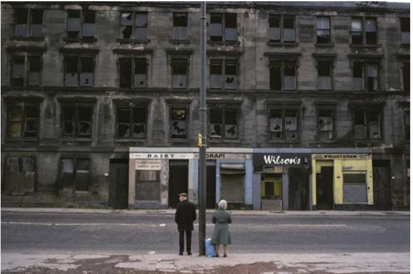
Glasgow, Scotland, 1980

"To travel, and be nothing at all Neither tourist, nor reporter Not trying to achieve anything... Or prove anything"