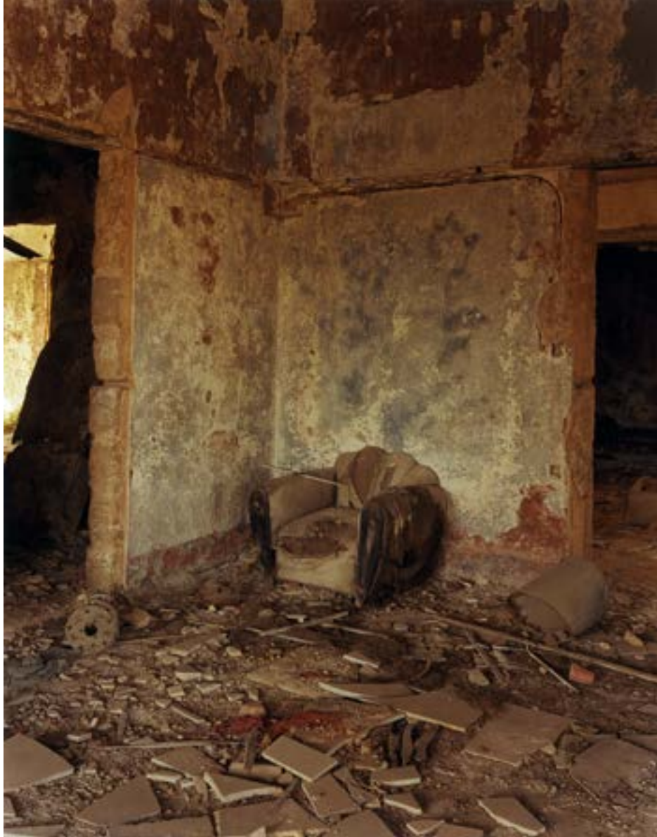
Former brothel, Beirut, Lebanon, 1991

“I’m a French photographer in downtown Beirut I’m walking in the street the light of the walls reassures me it guides me, I’m happy Happy to be working with a big camera No more dodging sniper fire there are no more enemies, I go back to the places of war to the places of the reporter I haven’t lost my way I still know where East and West is. Although the bus-barricades have gone, the buildings are the same It’s the same city, I love this city that’s now free.”