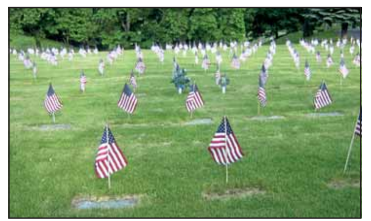
Flags decorate the graves of fallen military in Pittsburgh's Highwood Cemetery.