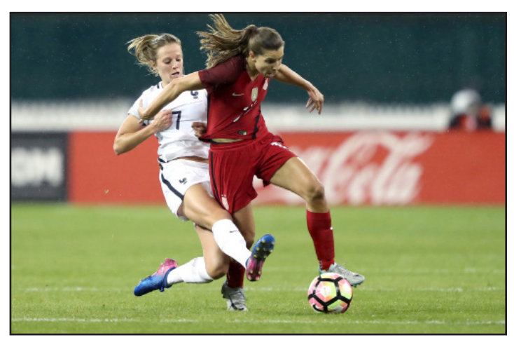
Tobin Heath - 2016 U.S. Women's Soccer Female Player of the Year