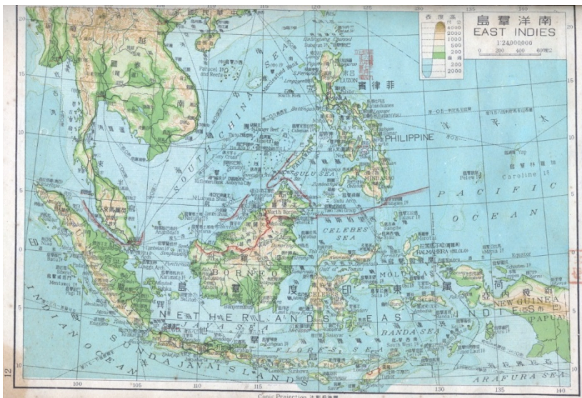
Figure 1. Map of the East Indies