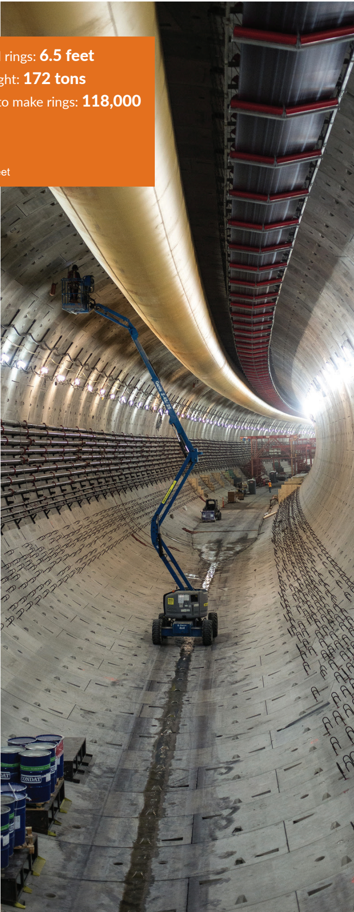
A completed section of the tunnel prior to the building of the road decks.

Piling the dirt on the football field in CenturyLink Field would create a tower of dirt that would overtop the stadium by 100 feet