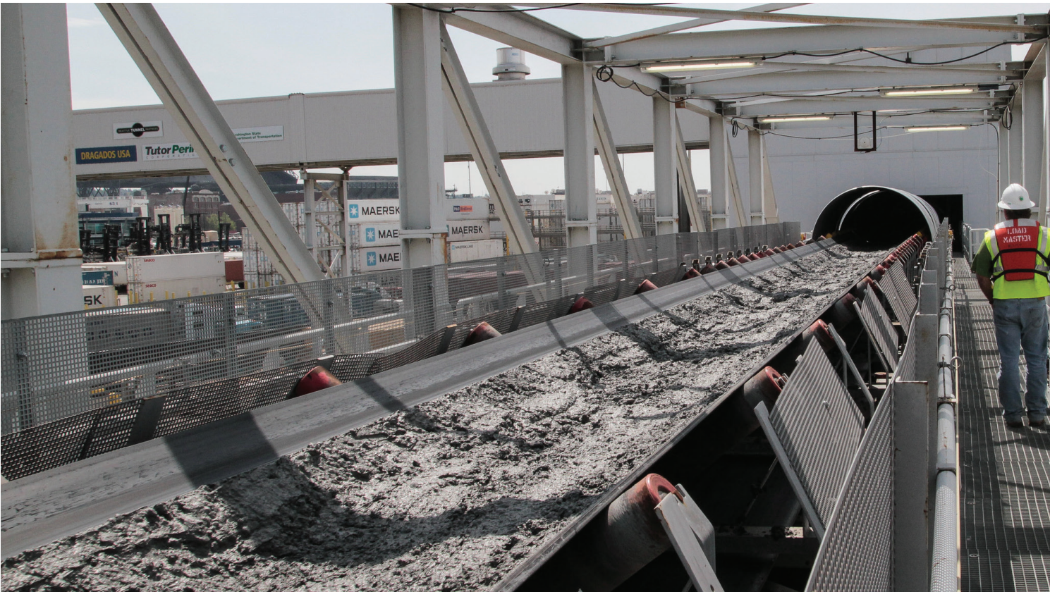
Conveyor carries spoils (tunnel soil) to the barge for disposal.