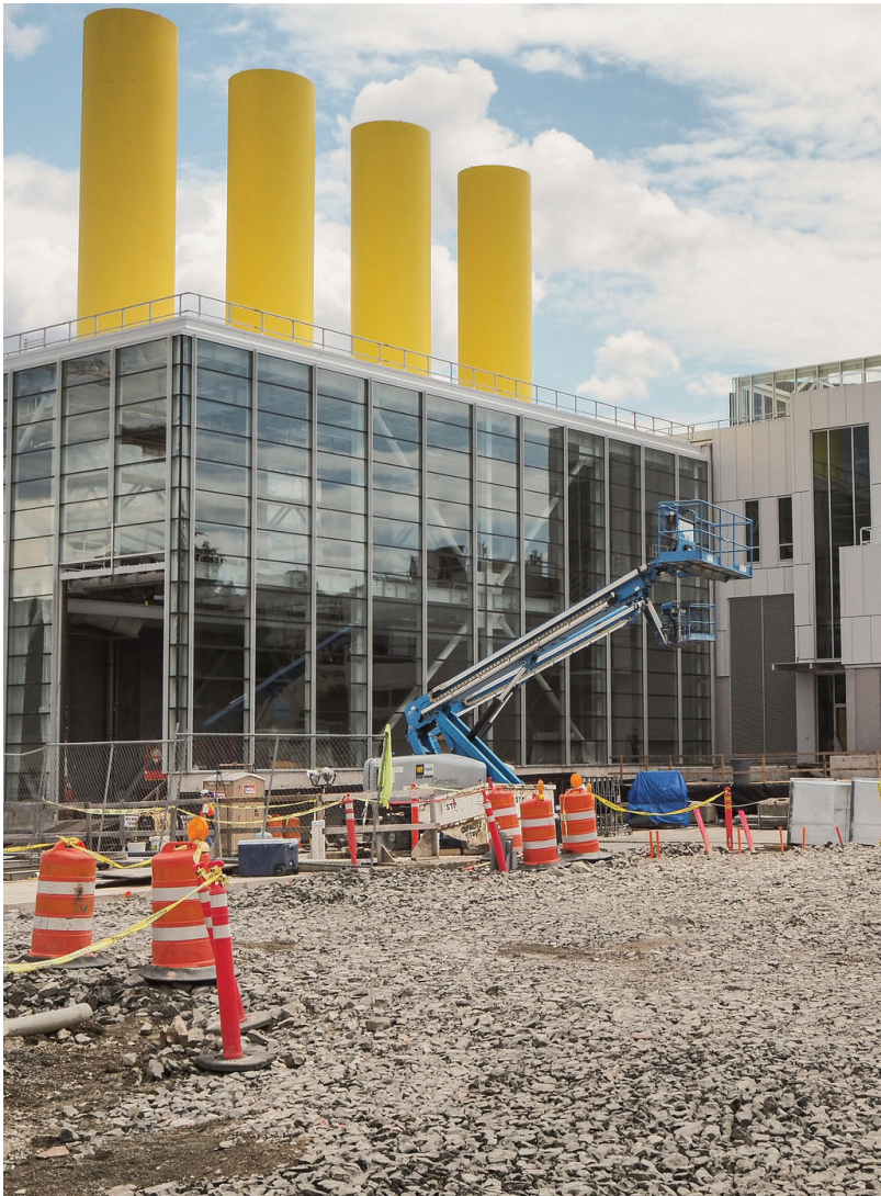
View of progress on the SR 99 tunnel's north portal operations building.