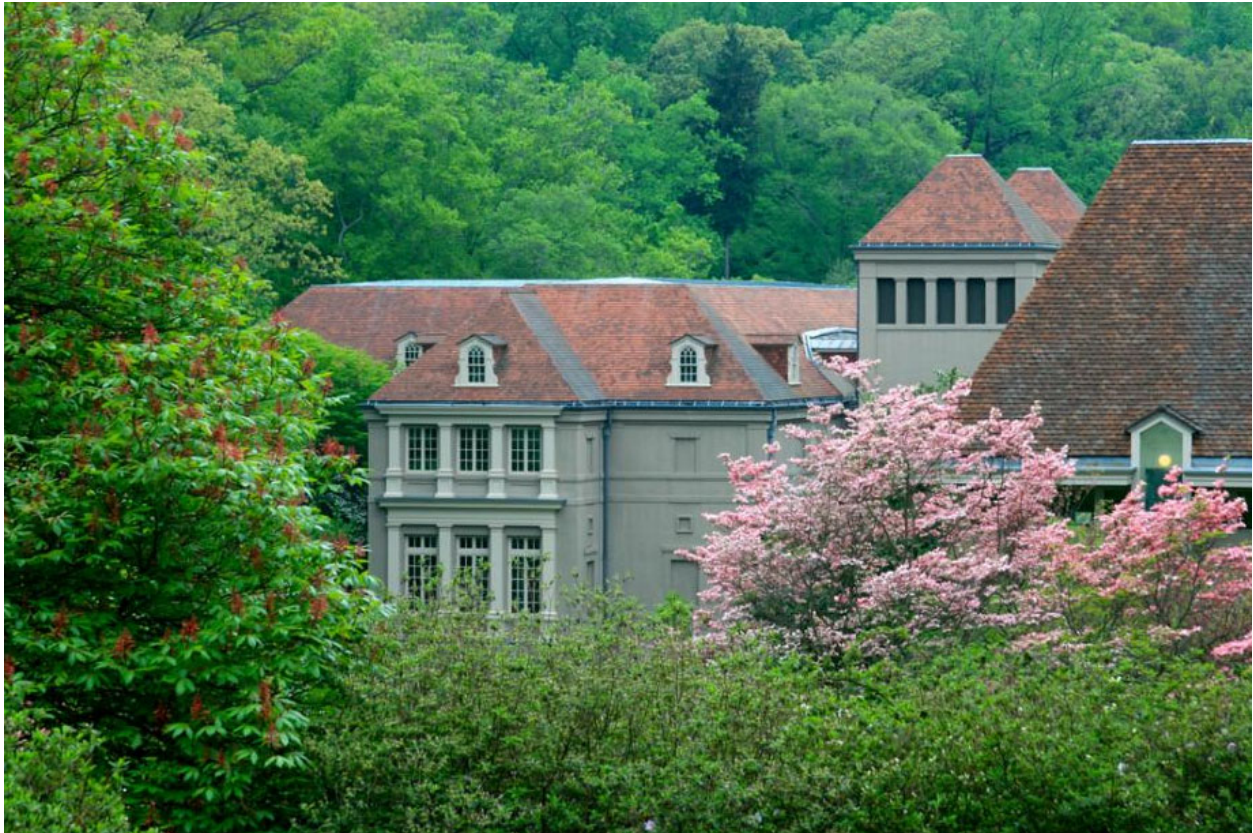
Winterthur Garden and Library