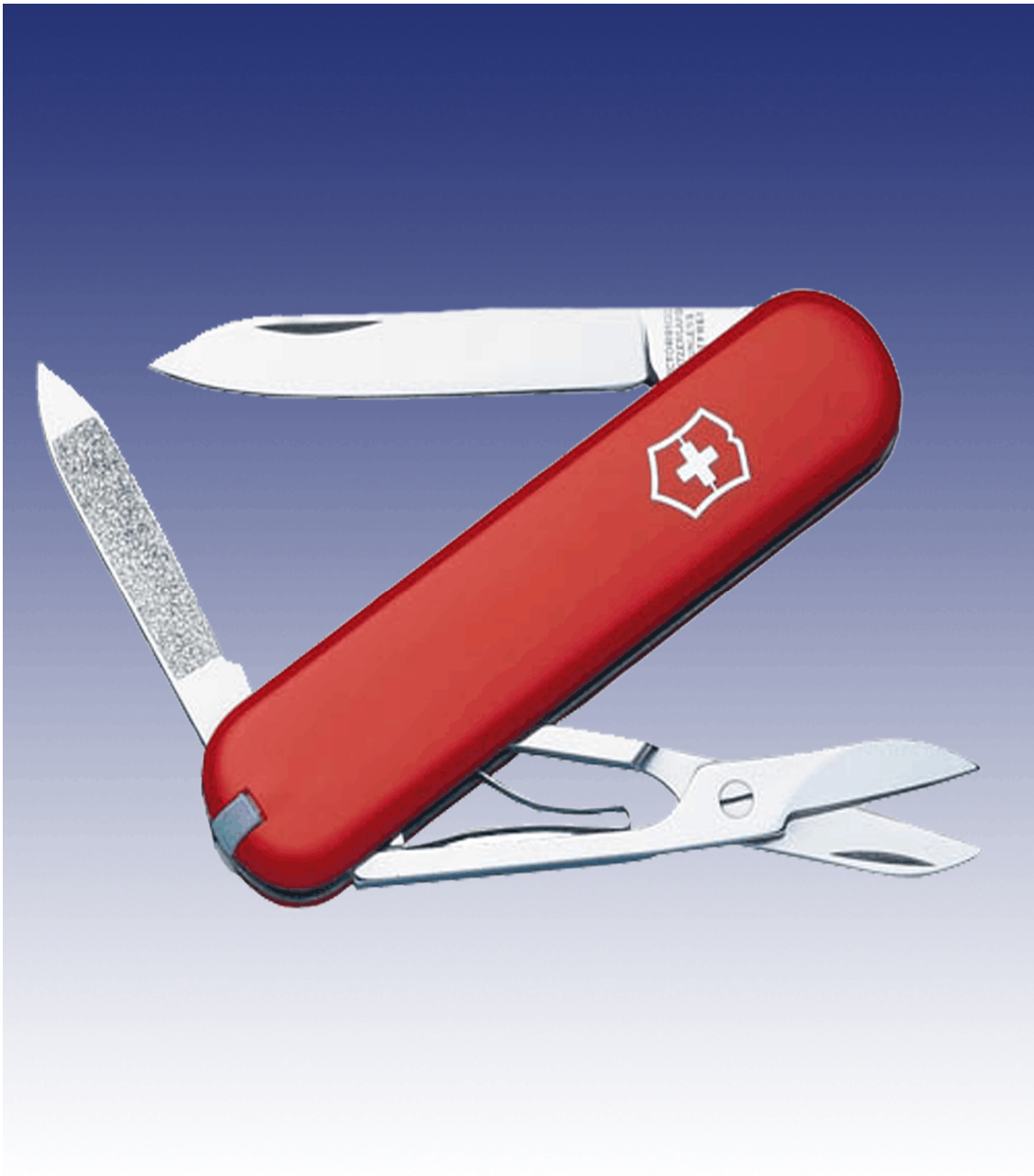
Exhibit 12: Picture of Defendant's Knife