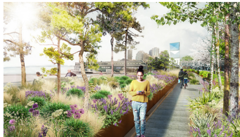
A landscaped pedestrian promenade will extend north-south along the waterfront from Pine Street to Pioneer Square