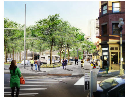
A rebuilt Alaskan Way will serve all modes of travel and provide clear and safe pedestrian crossings and signalized intersections

For more information about Waterfront Seattle: