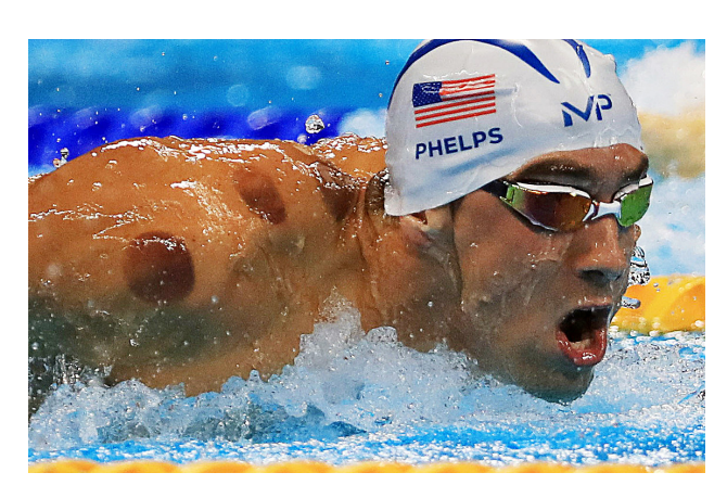
Fig. 3. Gold Metalist Michael Phelps, in this Reuters photo by Dominic Ebenbichler, is shown competing at the 2016 Olympics in Rio de Janeiro, Brazil, with red cupping marks on his shoulder.

who took meldonium. By claiming that cupping and meldonium were similarly effective for their respective purposes, the Russians wanted both held to the same standard. If cupping is allowed, why not meldonium?