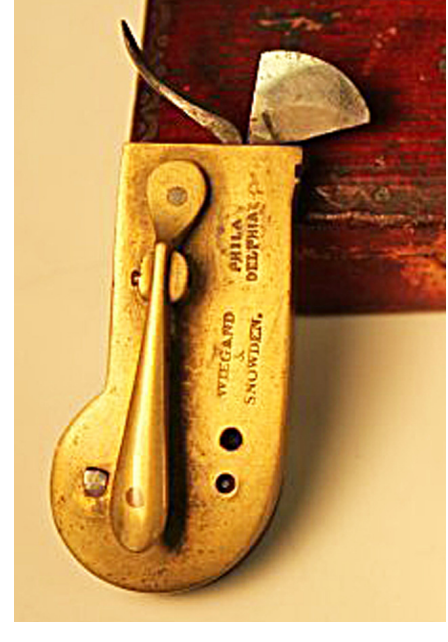
Fig. 2. Spring-loaded fleam imprinted "Wiegand & Snowden, Philadelphia."

vacuum-suction, was placed over the area. This process caused the skin to become swollen and bruised. For wet cupping, the skin was either scraped or cut open before the cups were applied, thus actually removing blood from the body.