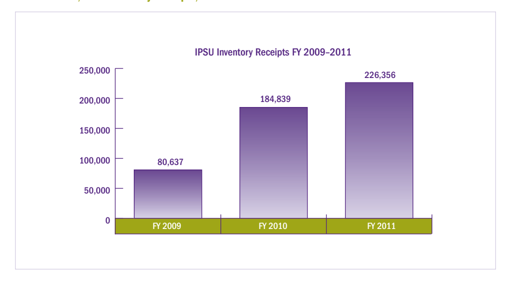
FIGURE 1.3.1, IPSU Inventory Receipts, FY 2009 to FY 2011<sup>10</sup>

TAS casework reflects the impact of the IRS's inability to promptly address identity theft victims' tax issues. TAS received 34,006 stolen identity cases in FY 2011, compared to 17,291 in FY 2010 and 14,023 in FY 2009.<sup>11</sup> This translates to a 97 percent increase in identity theft receipts in FY 2011 over FY 2010, on top of a 23 percent gain from FY 2009 to FY 2010. Moreover, this increase does not include 26,695 cases that meet TAS's "systemic burden" case criteria and were referred to the IPSU for processing under the March 2010 Memorandum of Understanding between TAS and the Wage and Investment (W&I) division.<sup>12</sup>