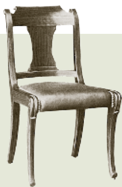
Small Side Chair

room for the secretary. A standard set of mahogany office furniture was made for each suite. The senator's set consisted of a flat-top desk, a swivel desk chair, two arm chairs, one small chair, an easy chair, a davenport, and bookcases (ordered at the senator's discretion after the building was occupied). The secretary's set included a rolltop desk and swivel chair, a rolltop typewriter desk and chair, a table, two armchairs, three side chairs, and a bookcase.