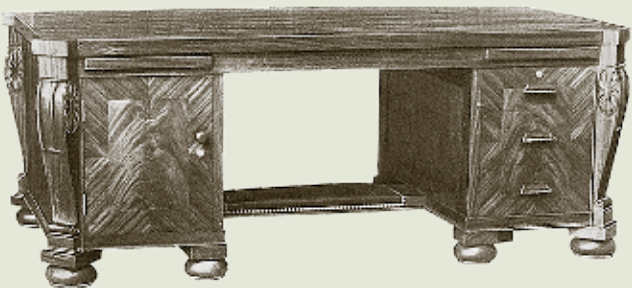
Flat Top Desk