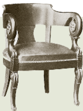
Round Arm Chair