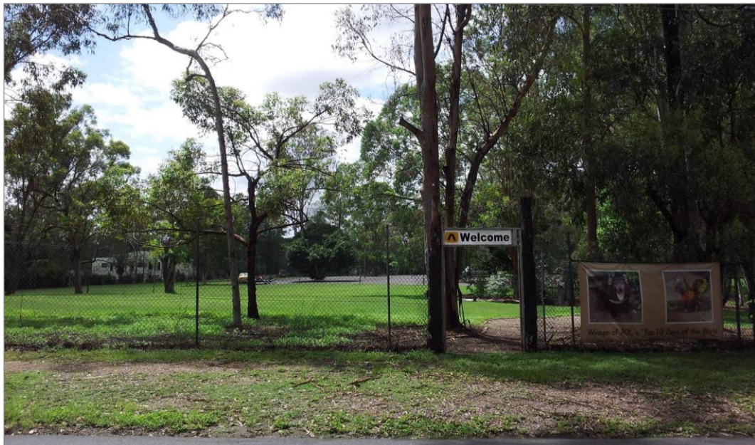
Figure 2 – The proposed site for the day care centre – to the left of Lone Pine Koala Sanctuary's main entrance (Wilson, design brief).