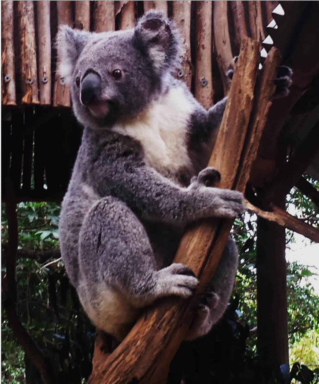
Figure 1 – A koala in the Lone Pine Sanctuary.

the spirit of sustainable education. The main aims of SE are to develop understandings of what it means, individually and as a global society, to respect, develop and use both natural and human made environments wisely, protect human rights, nurture multiculturalism, and take responsibility for actions that affect natural and human wellbeing, both now and into the future (Macdonald, 2009).