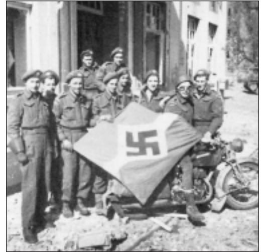
IN GERMANY, IN APRIL 1945, A GROUP FROM THE LAKE SUPERIOR REGIMENT DISPLAY THE ENEMY FLAG THEY HAD CAPTURED.