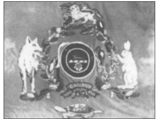
THE SIX NATIONS WOMEN'S PATRIOTIC LEAGUE EMBROIDERED THIS FLAG FOR THE 114TH CANADIAN INFANTRY BATTALION. THE BATTALION HAD PERMISSION TO CARRY IT ALONG WITH THE KING'S COLOURS AND THEIR REGULAR REGIMENTAL COLOURS.