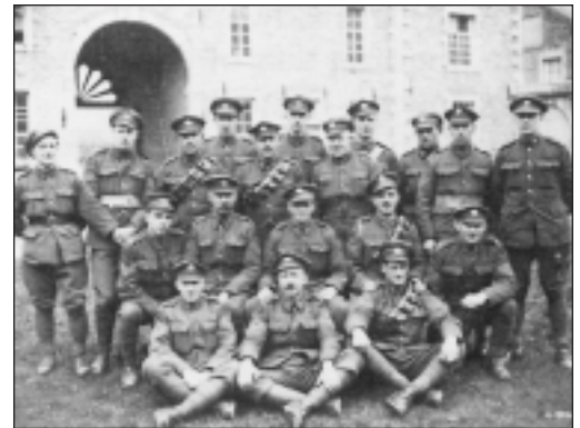
COMPANY 6 OF THE ROYAL CANADIAN ENGINEERS DUG TUNNELS AT VIMY RIDGE, PATCHED UP ROADS NEAR AMIENS AND DEFUSED MINES AFTER THE WAR. HERE THE COMPANY'S NON-COMMISSIONED OFFICERS POSE IN BELGIUM FOUR MONTHS AFTER THE ARMISTICE.