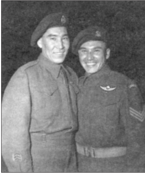
IN THE DEVIL'S BRIGADE, TOMMY PRINCE BECAME AN EXPERT IN RECONNAISSANCE. HE ONCE POSED AS A LOCAL FARMER TO REPAIR A SEVERED COMMUNICATIONS WIRE – IN FULL VIEW OF ENEMY TROOPS. HERE HE IS SHOWN (RIGHT) WITH A BROTHER AT BUCKINGHAM PALACE, WHERE HE WAS AWARDED TWO GALLANTRY MEDALS.