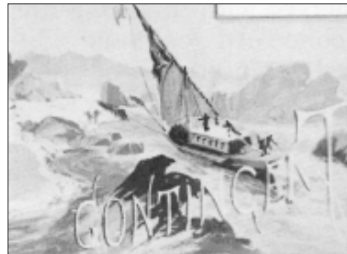
EIGHTY-SIX INDIAN VOLUNTEERS HELPED GUIDE GENERAL WOLSELEY AND HIS TROOPS UP THE NILE RIVER IN 1884 SO THEY COULD RELIEVE BRITISH SOLDIERS DURING THE BATTLE OF KHARTOUM. ALONG WITH SOME 300 OTHER CANADIANS, THESE NATIVE BOATMEN WERE THE NILE VOYAGEURS.

Most Canadians, Natives included, served in the infantry with the Canadian Corps in the Canadian Expeditionary Force (CEF). Many Natives became snipers or reconnaissance scouts, drawing upon traditional hunting and military skills to deadly effect.