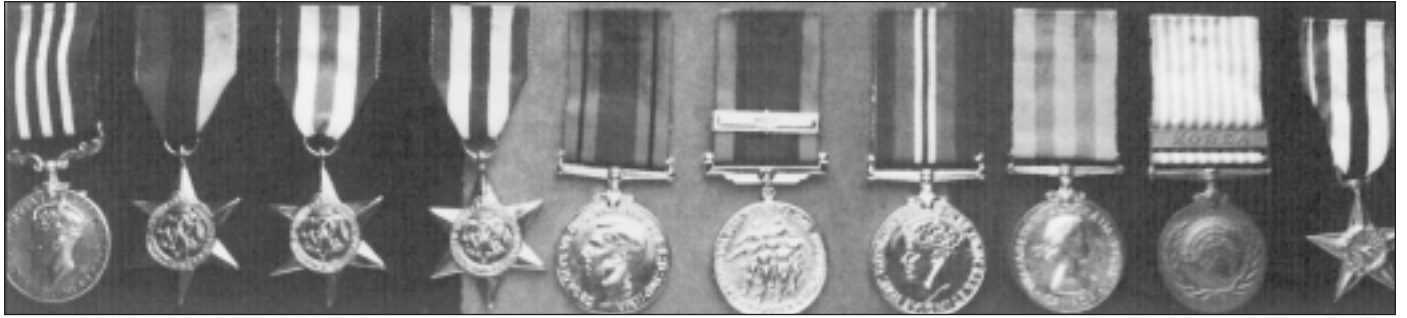
THE MEDALS OF TOMMY PRINCE. THE MILITARY MEDAL IS ON THE FAR LEFT, WHILE THE SILVER STAR IS ON THE FAR RIGHT. NOT SHOWN IN THE CANADIAN VOLUNTEER SERVICE MEDAL OF KOREA, WHICH WAS PRESENTED TO THE PRINCE FAMILY IN 1992 BY THE MINISTER OF VETERANS AFFAIRS.