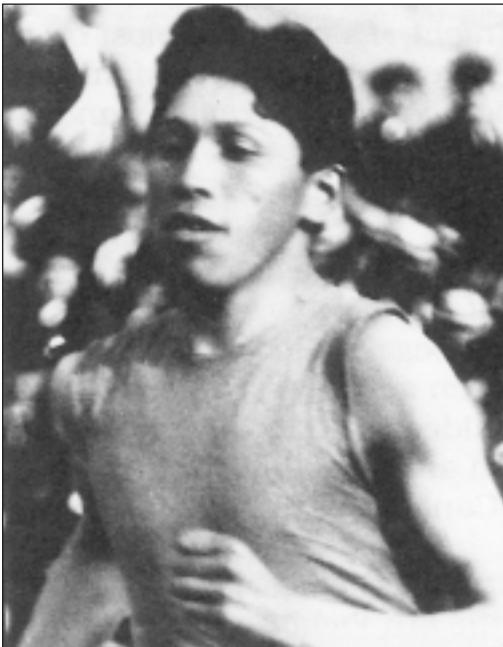
TOM LONGBOAT CONTINUED TO RUN AFTER JOINING THE CANADIAN EXPEDITIONARY FORCE. THE FAMOUS SIX NATIONS’ DISTANCE RUNNER BECAME A DISPATCH CARRIER WITH THE 107 TH BATTALION. AS WELL, HE COMPETED IN ARMY SPORTING CONTESTS, AND WON THE DOMINION DAY COMPETITION’S EIGHT-MILE RACE IN 1918.

Thomas Charles Longboat did not receive any awards for bravery. He was not killed in the thick of battle while performing a daring feat above and beyond the call of duty. Rather, he is an example of the selfless response of Canadians to the chaos spreading throughout Europe.