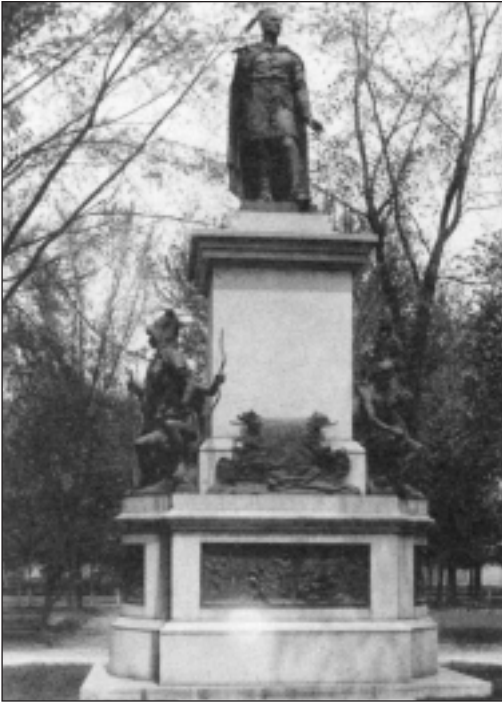
THE BRANT MEMORIAL IN BRANTFORD, ONTARIO HONOURS THE MOHAWK CHIEF JOSEPH BRANT, WHO FOUGHT ALONGSIDE BRITISH TROOPS DURING BOTH THE SEVEN YEARS' WAR AND THE AMERICAN REVOLUTION.