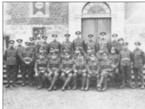
PEGAHMAGABOW SERVED OVERSEAS FOR ALMOST THE ENTIRE WAR AND REMAINED IN EUROPE AN ADDITIONAL FIVE MONTHS AFTER THE ARMISTICE. BACK HOME, HE WOULD JOIN THE MILITIA. HERE PEGAHMAGABOW'S FELLOW NON-COMMISSIONED OFFICERS OF THE 1ST BATTALION POSE TWO MONTHS AFTER THE END OF THE WAR (HE IS NOT IN THE PICTURE BECAUSE HE WAS IN ENGLAND RECEIVING MEDICAL TREATMENT AT THE TIME).