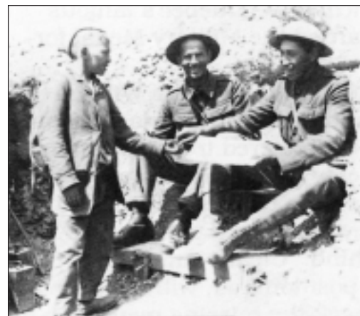
LONGBOAT WAS WOUNDED TWICE AND ONCE WAS WRONGLY REPORTED KILLED. HE WOULD SURVIVE THE WAR. HERE HE IS SHOWN BUYING A NEWSPAPER FROM A FRENCH NEWSBOY IN 1917.