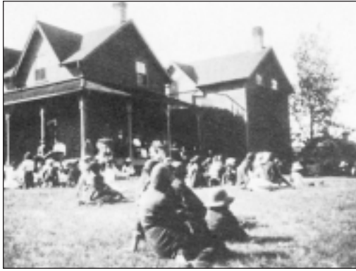
ABORIGINAL CANADIANS DONATED AT LEAST $44,000 FOR WAR RELIEF, AND FORMED MANY CHARITY GROUPS LIKE THIS RED CROSS SOCIETY, MEETING AT THE FILE HILLS INDIAN COMMUNITY AT BELCARRES, SASKATCHEWAN IN 1915.