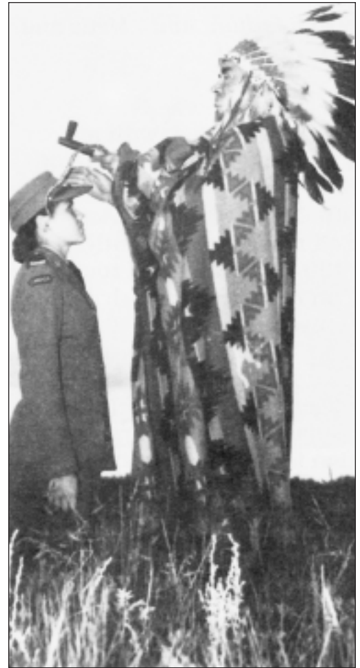
DURING THE FIRST AND SECOND WORLD WARS IN PARTICULAR, INDIAN RESERVES IN CANADA WITNESSED THE DEPARTURE OF MANY OF THEIR YOUNG ADULT MEMBERS. HERE AN INDIAN CHIEF BLESSES A NEW RECRUIT WHO IS ABOUT TO LEAVE HER RESERVE AFTER ENLISTING IN 1942, DURING THE SECOND WORLD WAR. (DEPARTMENT OF NATIONAL DEFENCE (DND) / NATIONAL ARCHIVES OF CANADA (NAC) / PA-129070)