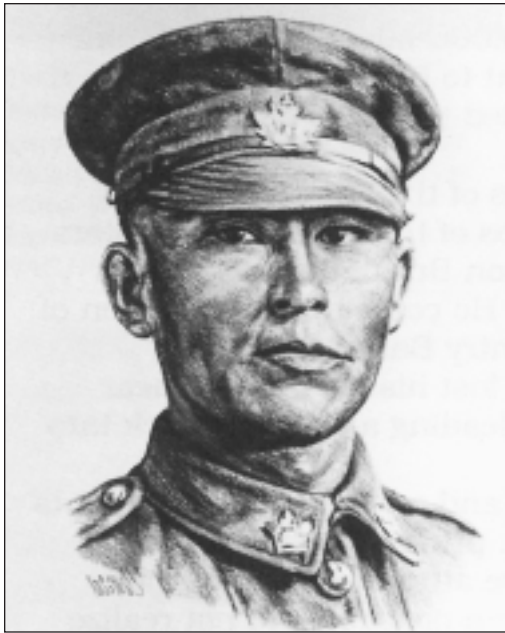
CPL. FRANCIS PEGAHMAGABOW OF THE PARRY ISLAND BAND IN ONTARIO WAS DECORATED THREE TIMES FOR THE MARKSMANSHIP AND SCOUTING SKILLS HE DISPLAYED IN BELGIUM AND FRANCE. KNOWN AS “PEGGY” TO OTHER MEMBERS OF HIS BATTALION, HE SURVIVED THE WAR AND LATER BECAME CHIEF OF HIS BAND. THIS PORTRAIT OF HIM BY ARTIST IRMA COUCILL WAS COMMISSIONED FOR THE INDIAN HALL OF FAME COLLECTION, HOUSED IN THE MUSEUM OF THE WOODLAND CULTURAL CENTRE IN BRANTFORD, ONTARIO.

In November 1917, the 1 st Battalion joined the assault near the village of Passchendaele. Here, roughly 20,000 Allied soldiers crawled from shell crater to shell crater, through water and mud.