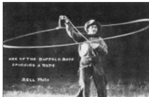
LIKE PEGAHMAGABOW, HENRY NORWEST DEVELOPED AN IMPRESSIVE REPUTATION AS A SNIPER DURING THE WAR. THE FORMER RODEO PERFORMER AND RANCH-HAND WAS CONSIDERED A HERO BY OTHER MEMBERS OF THE 50 TH BATTALION. THEY WERE STUNNED WHEN HE WAS KILLED BY AN ENEMY SNIPER THREE MONTHS BEFORE THE WAR ENDED.