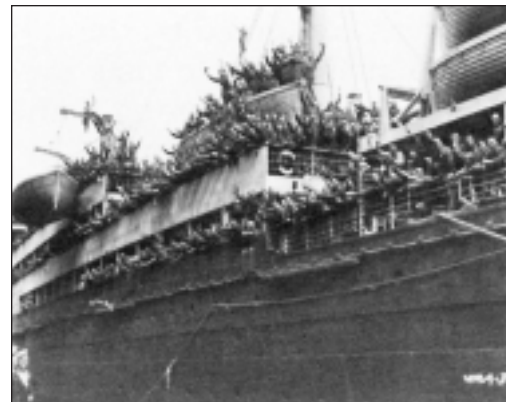
IN AUGUST 1940 THE 2 ND CANADIAN INFANTRY DIVISION SAILED FOR GREAT BRITAIN. DURING SIX YEARS OF WAR, MORE THAN ONE MILLION CANADIAN MEN AND WOMEN ENLISTED, INCLUDING AT LEAST 3,000 INDIANS AND AN UNKNOWN NUMBER OF ABORIGINAL CANADIANS WHO WERE NOT CONSIDERED STATUS INDIANS.

Many Indian bands responded to the government's declaration with protest marches and petitions delivered to Ottawa. Their members questioned their requirement to serve in this war, when they had been exempt from compulsory service in the previous one.