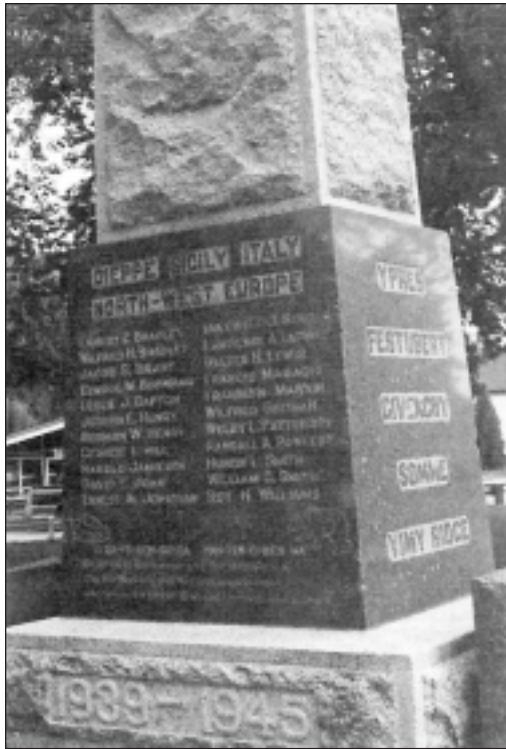
THE SIX NATIONS-MISSISSAUGA WAR MEMORIAL AT VETERANS' PARK IN OHSWEKEN, ONTARIO COMMEMORATES THE RESERVE'S WAR-DEAD AND HONOURS THOSE WHO SERVED AND SURVIVED.