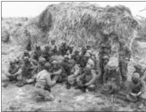
IN ITALY, A PATROL OF THE DEVIL'S BRIGADE UNDERGOES A LAST-MINUTE BRIEFING BEFORE SETTING OUT.