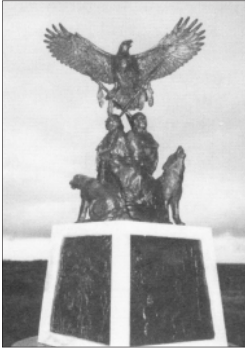
THE NATIONAL ABORIGINAL VETERANS WAR MONUMENT.