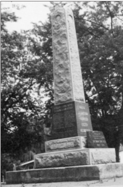
THE SIX NATIONS-MISSISSAUGA WAR MEMORIAL COMMEMORATES THE RESERVE'S VETERANS OF THE FIRST AND SECOND WORLD WARS AND THE KOREAN WAR.