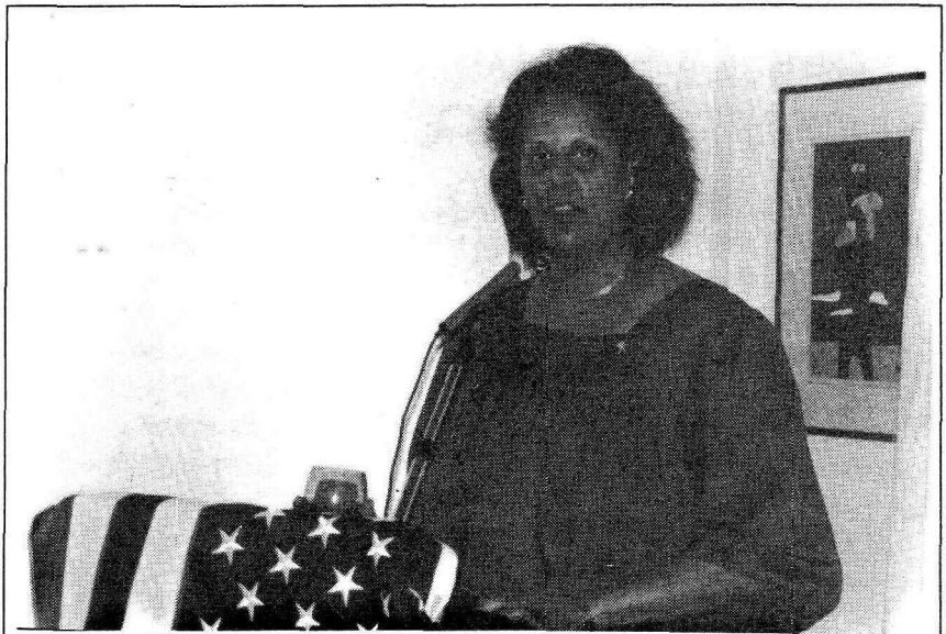
U.S. INDEPENDENCE DAY CELEBRATED IN FSM - Ambassador Aurelia Brazeal places special emphasis on the virtues of democracy, importance of nation-building, and Bill of Rights, as she delivers her remarks during the U.S. Independence day celebration held at her residence.

"Use of information leads me to underscore the importance of education. Education is another priority of the FSM which the U. S supports. Feeding the minds of boys and girls in (See INDEPENDENCE, Page 7)