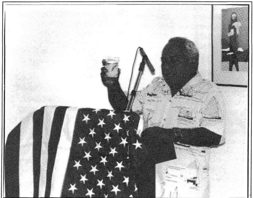
U.S. INDEPENDENCE DAY - President Bailey Olter after his remarks proposed a toast during the U.S. Independence Day celebration at the U.S. Ambassador's residence. See story on Page 5.

In the state of Chuuk all proposed amendments did not pass, Pohnpei (See AMENDMENTS, Page 2)